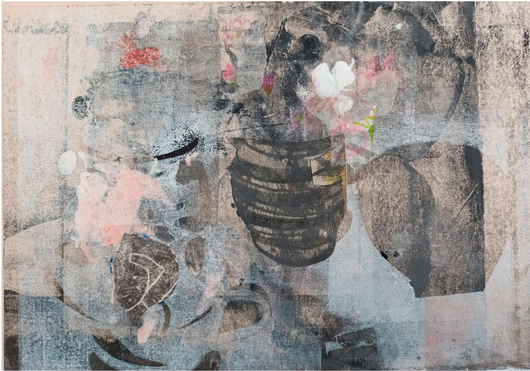
Soft Grey Light, monoprint, oil on paper 20 x 30cm