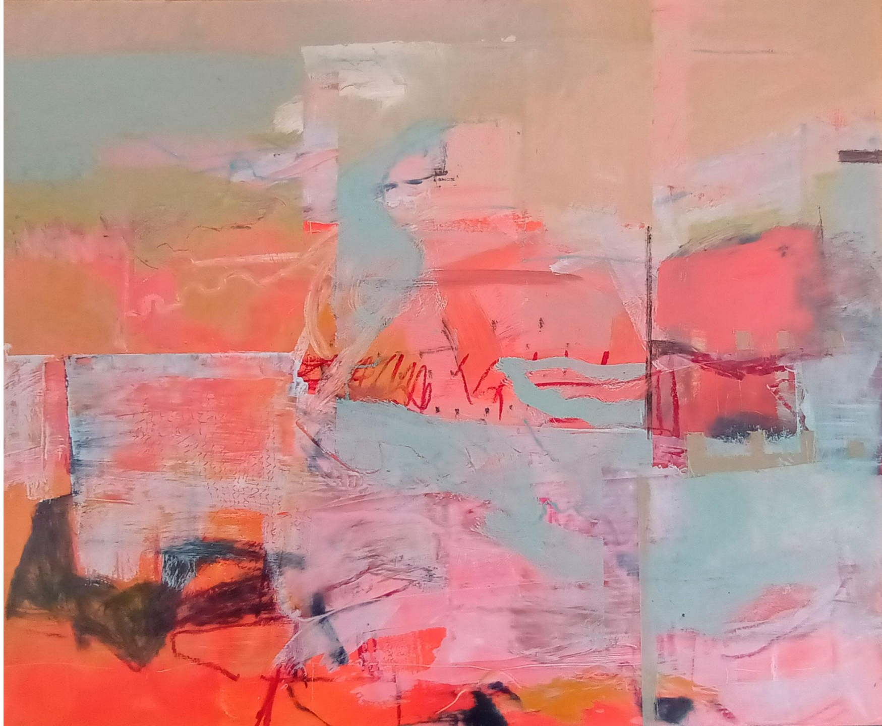
Slack Water oil on board 40 x 60 cm