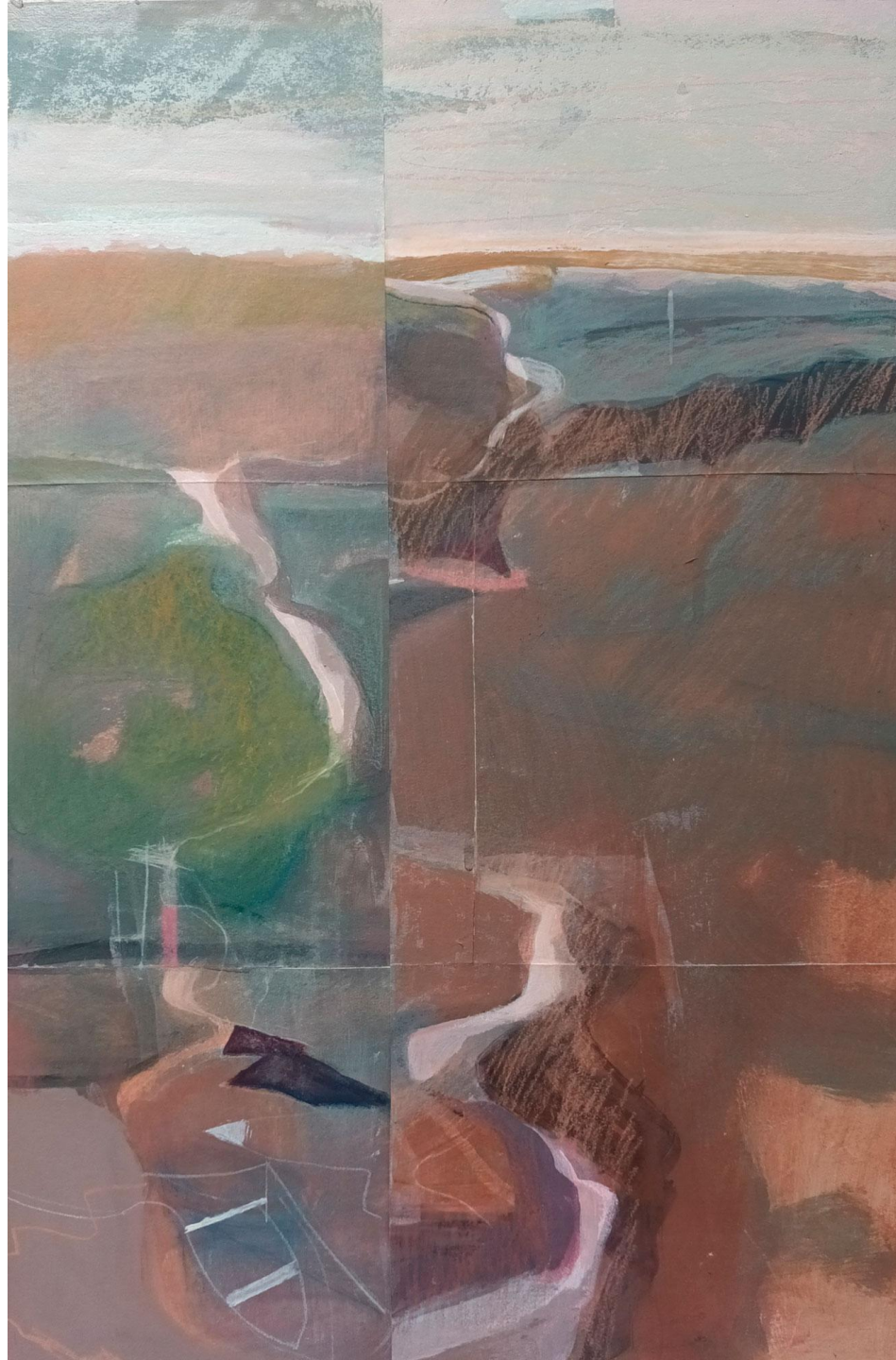
Tidal Marsh Shift Acrylic on paper 53 x 38cm