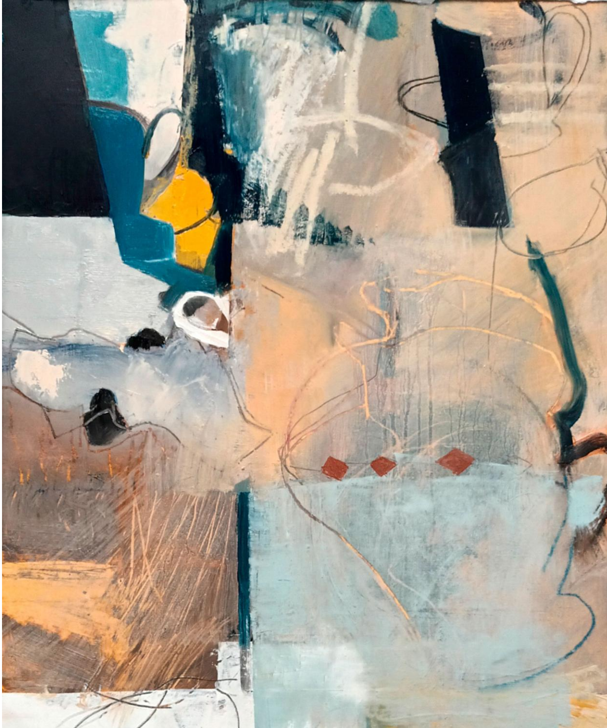
Jug Ears, oil on paper 44 x 36cm