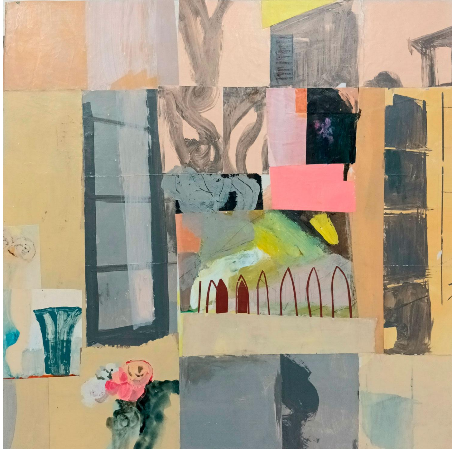
A Tourist in Bologna, Studio Morandi 1 pieced acrylic painted paper 50 x 50cm