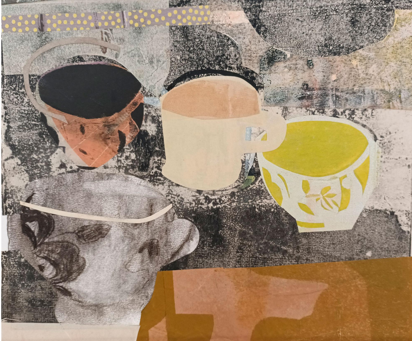
Yellow Cup, pieced monprint, oil on paper, 24 x 29 cm