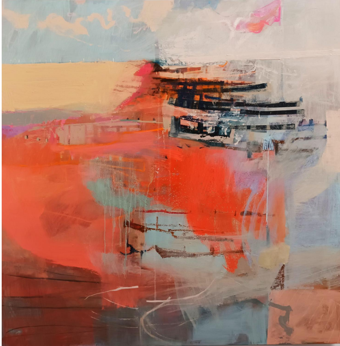
Ebb and Flow, One Day oil on canvas 100 x 100cm