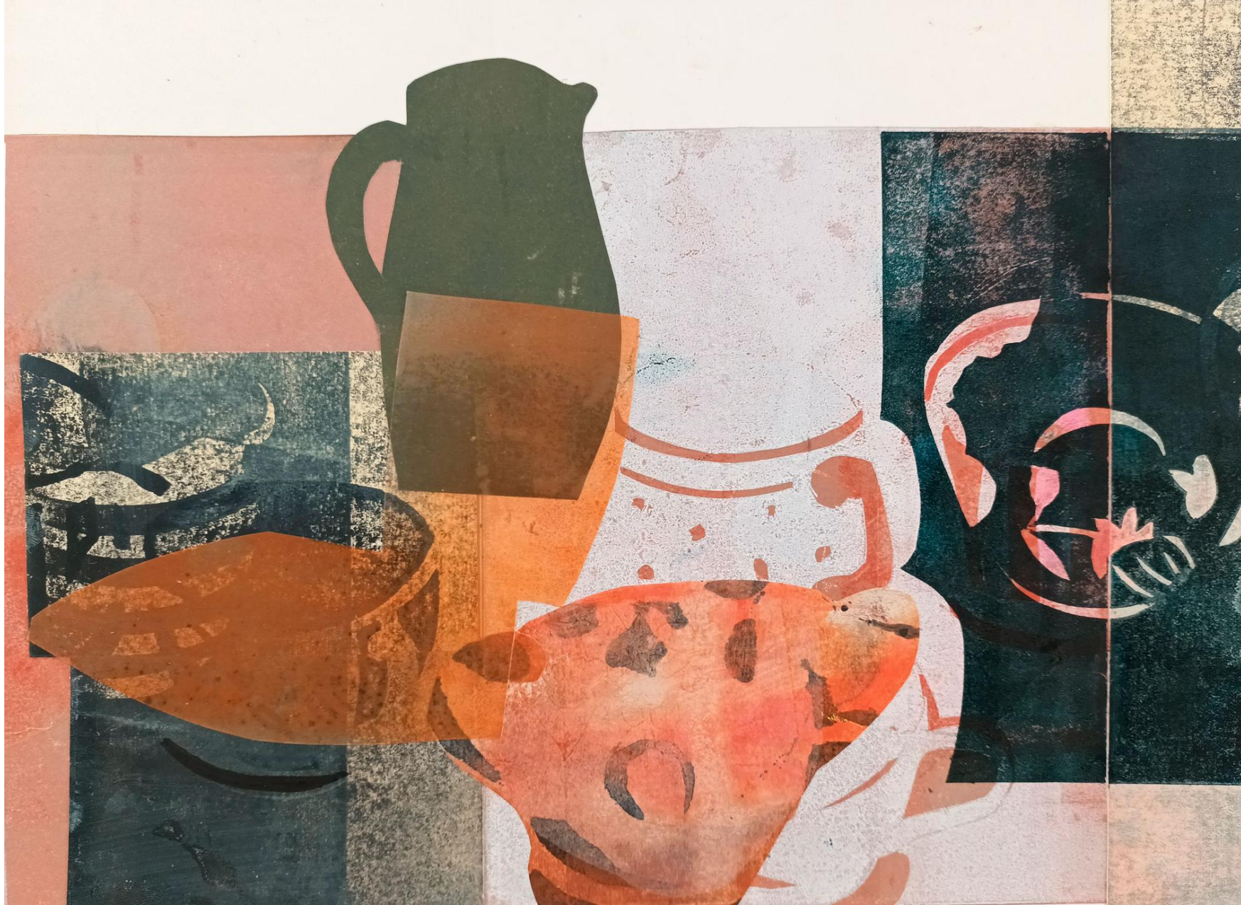
The Table with Pink Dots, pieced monprint, oil on paper, 24 x 33cm