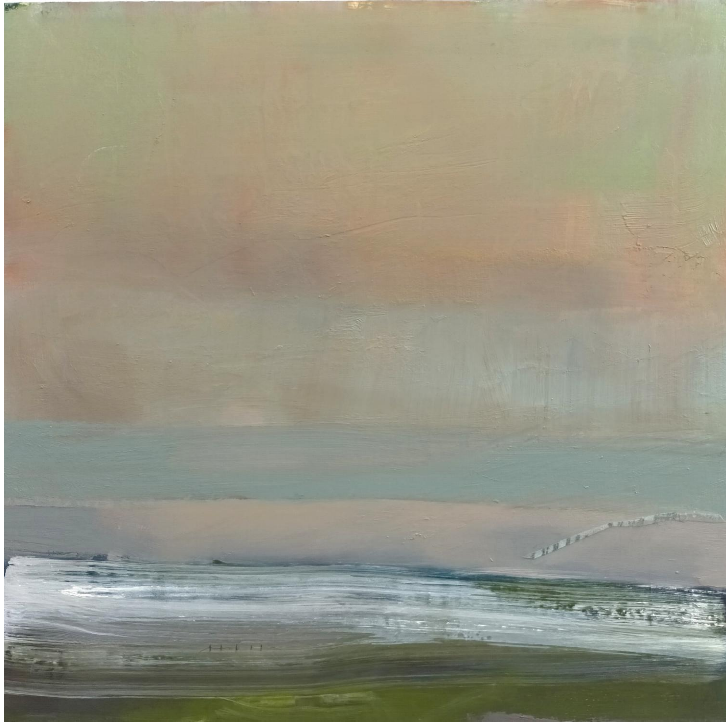
The Beach After Rain oil on board 50 x 50cm