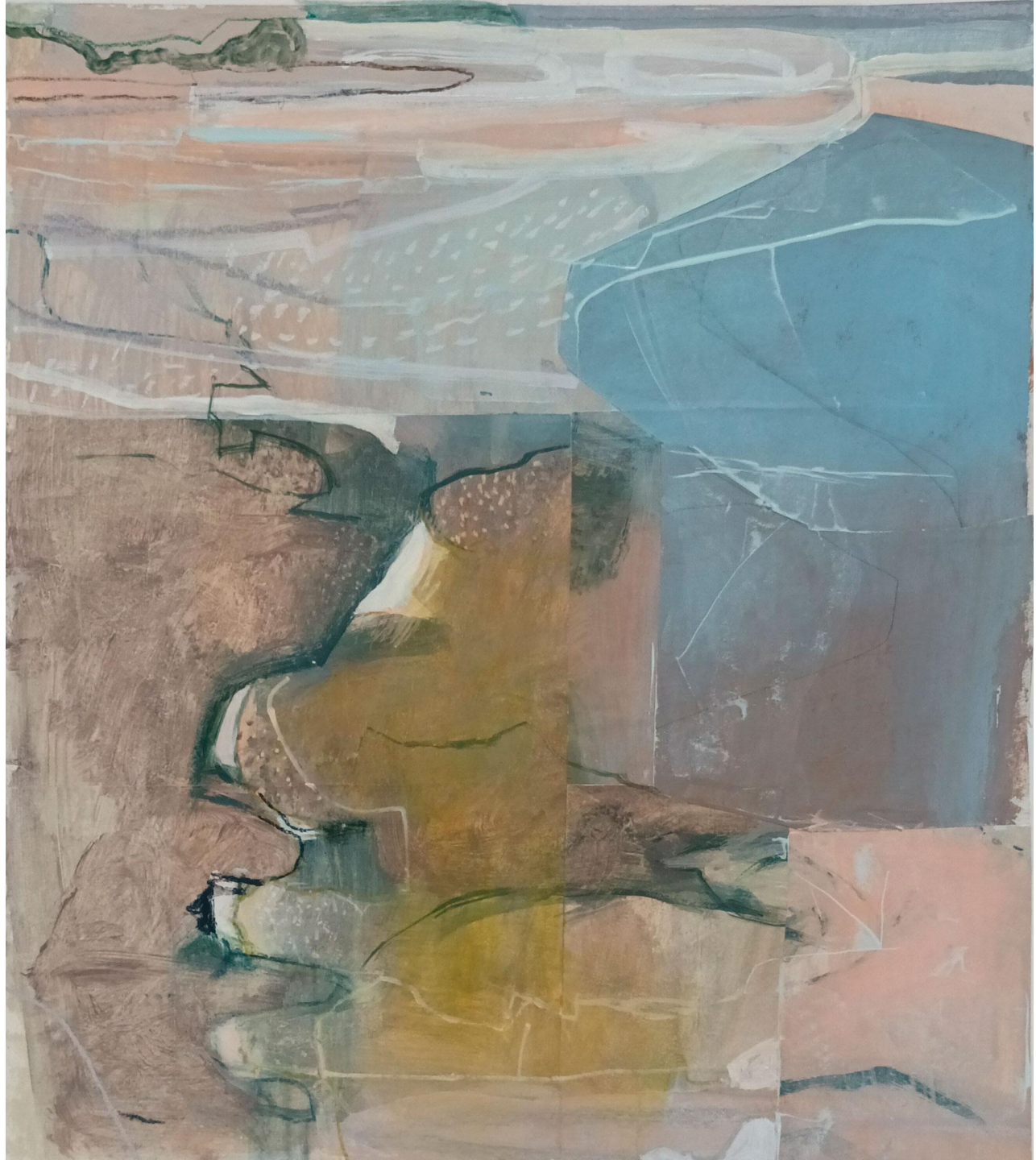
Flood Tide Creeping acrylic on paper 55 x 48cm