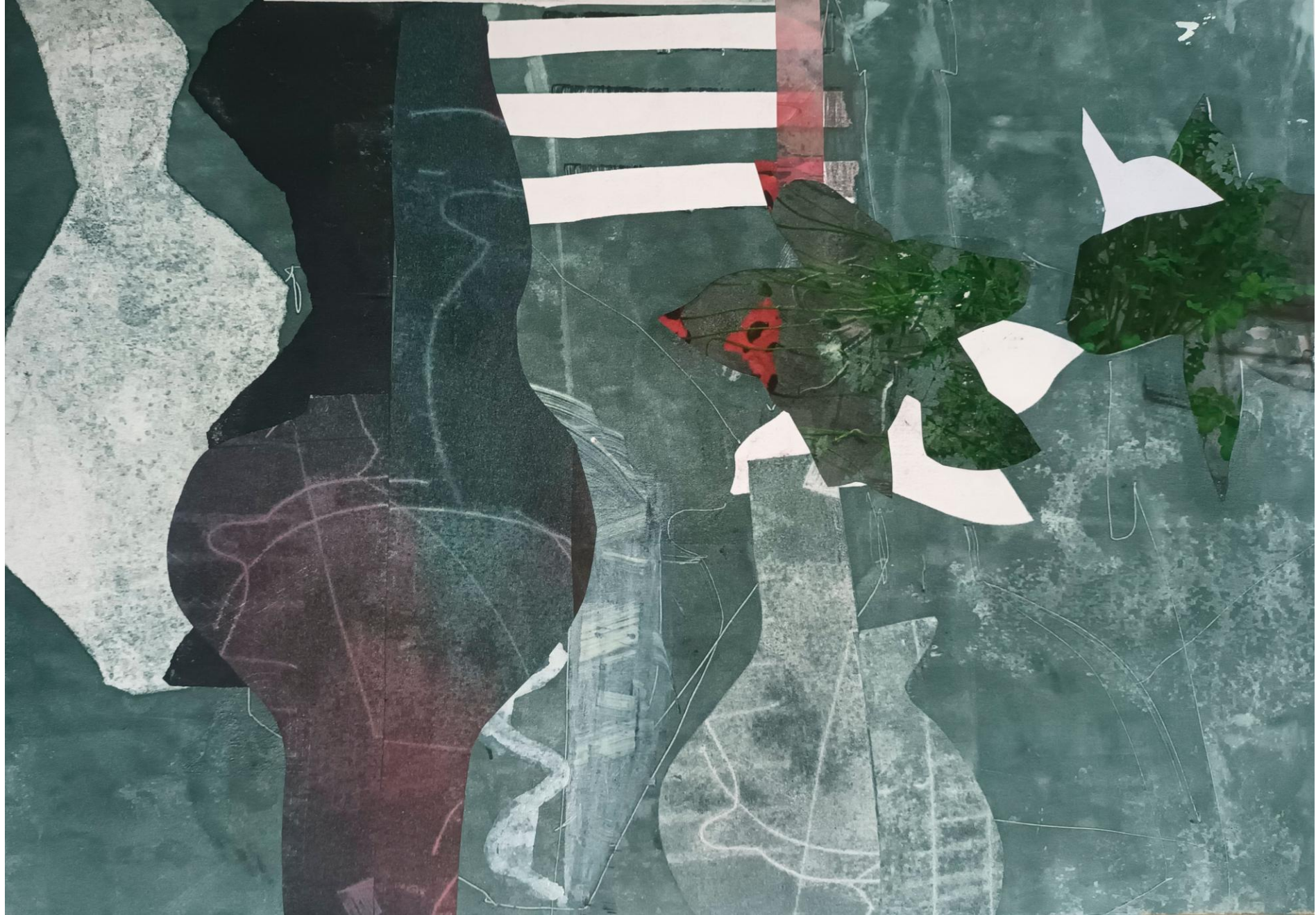
Red Poppy, Venetian Blind, pieced monprint, oil on paper, 28 x 37cm