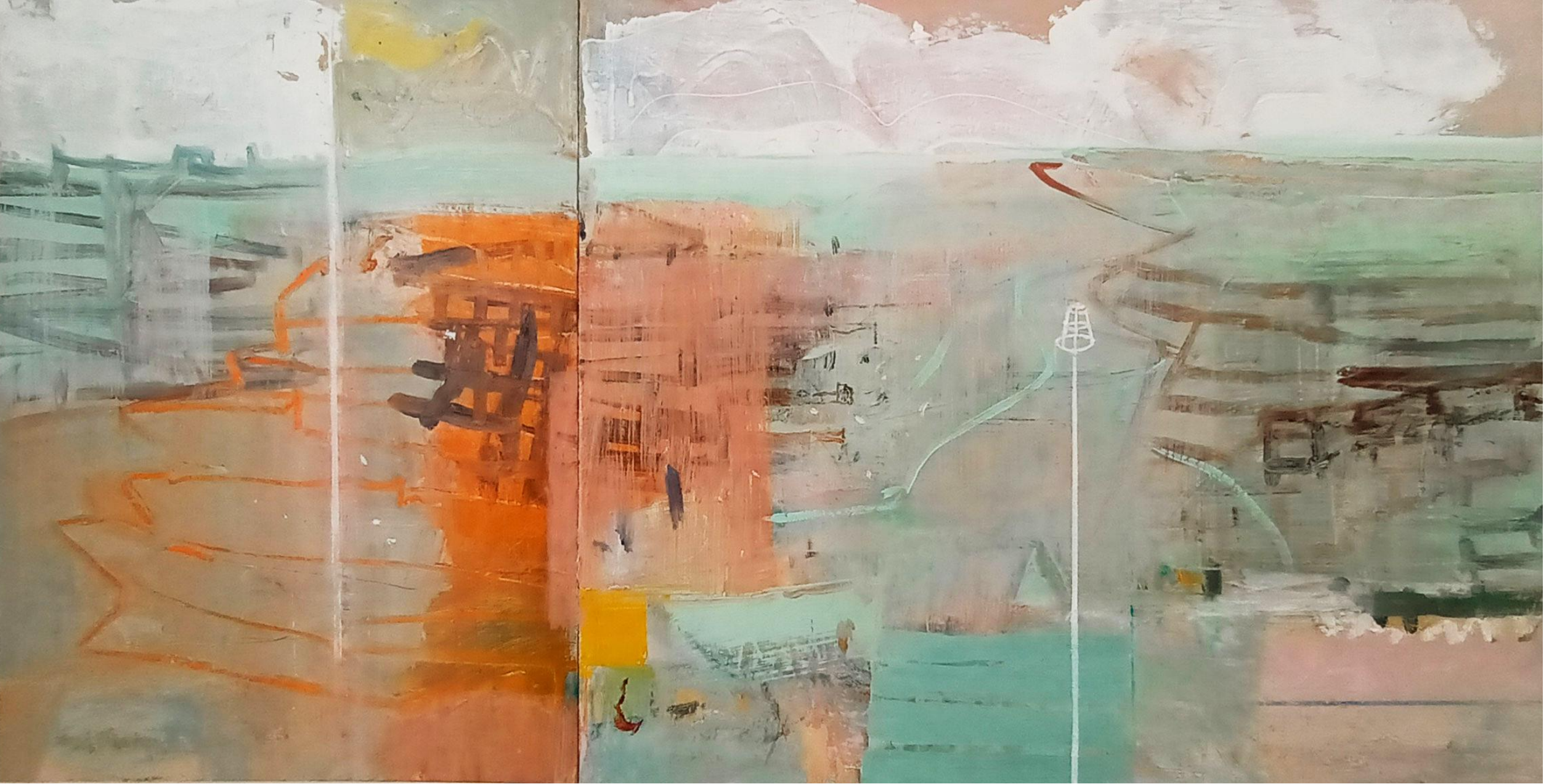
Ebb Tide, Wet Sands, oil on board, 40 x 80cm