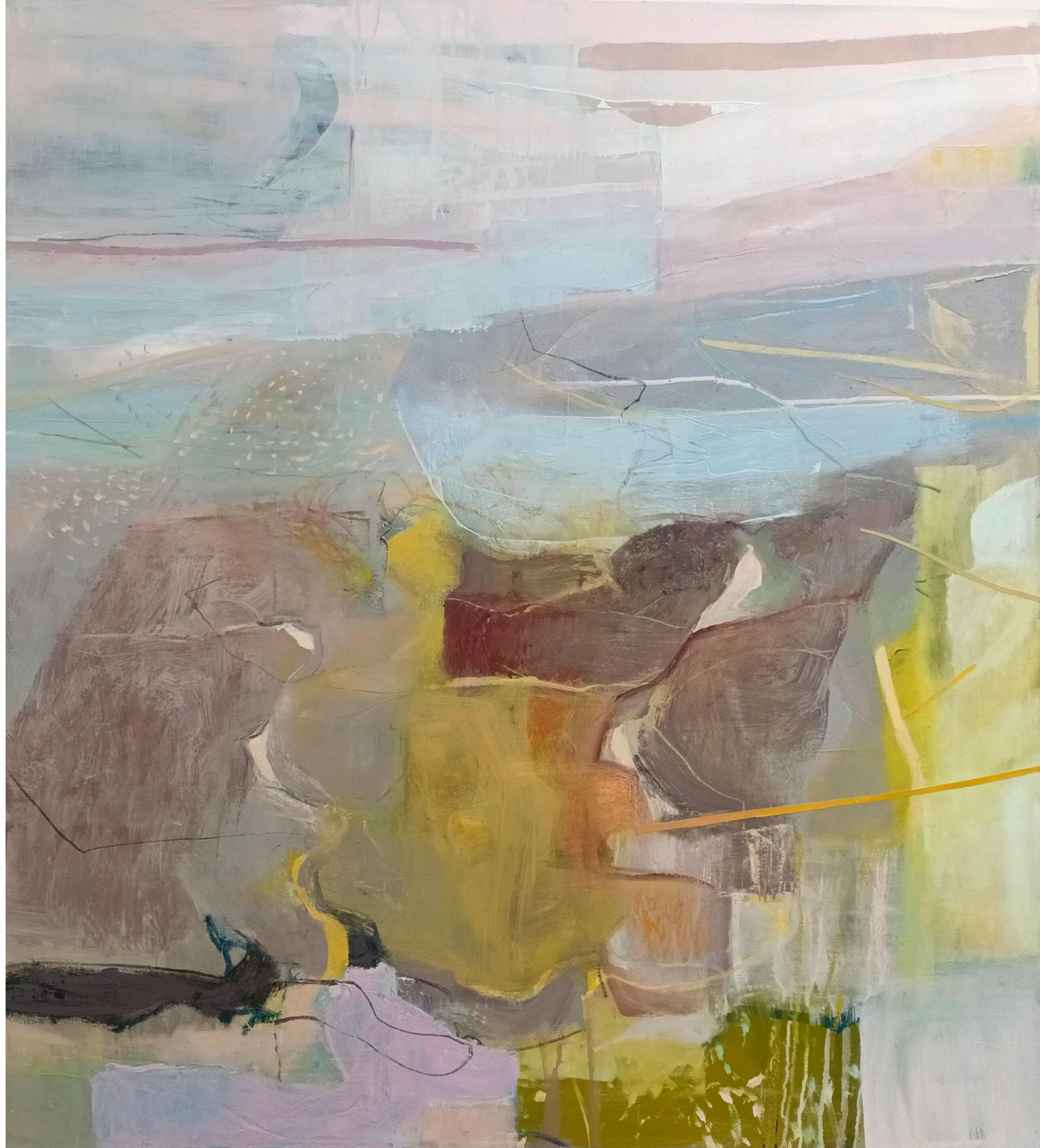
Confluence oil on canvas 100 x 100cm