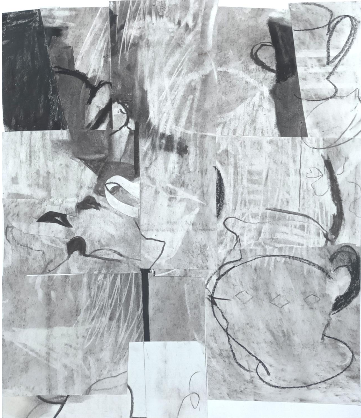
Jug Ears charcoal study on paper 44 x 36cm