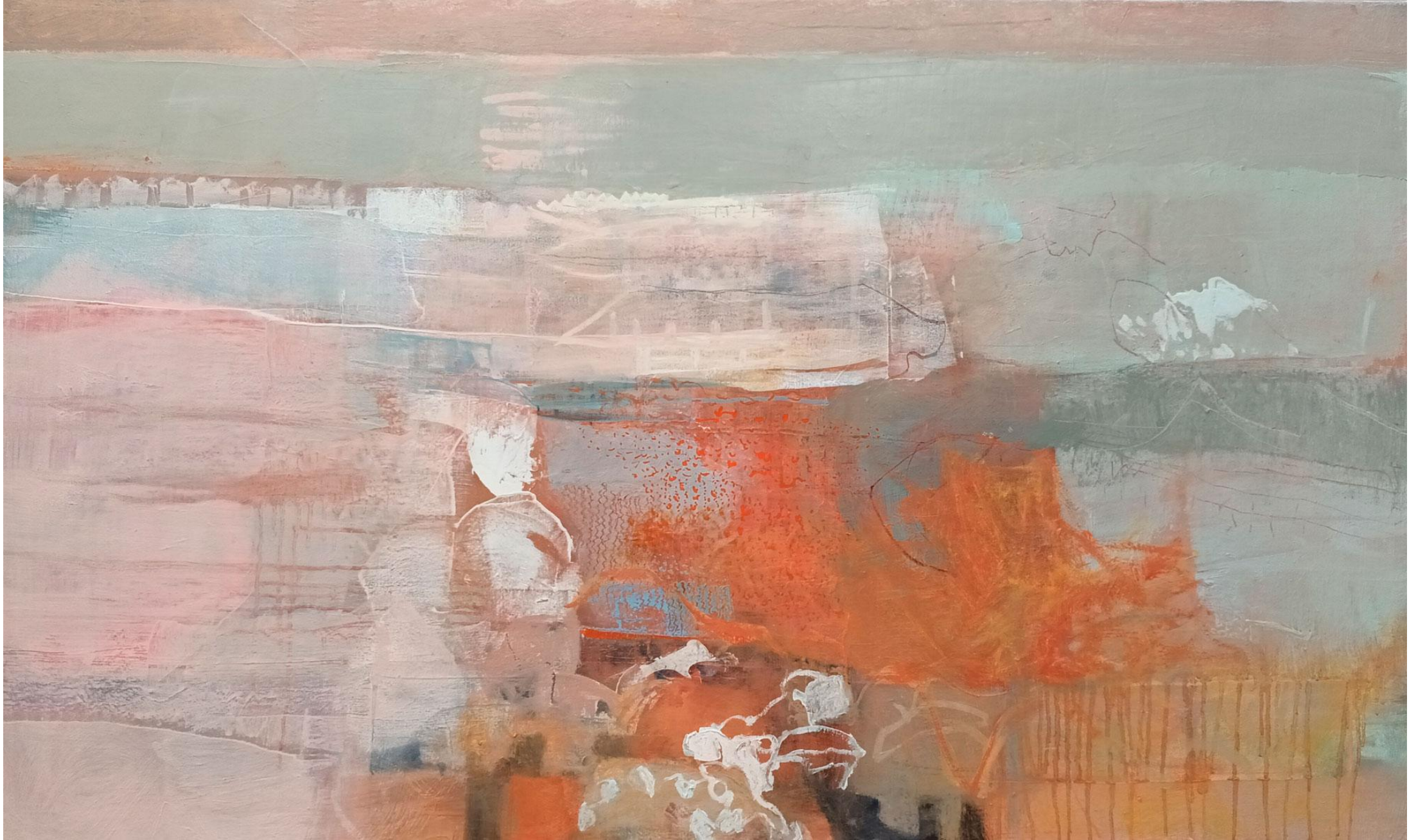
Strand, Goring By Sea, oil on canvas, 67 x 100cm