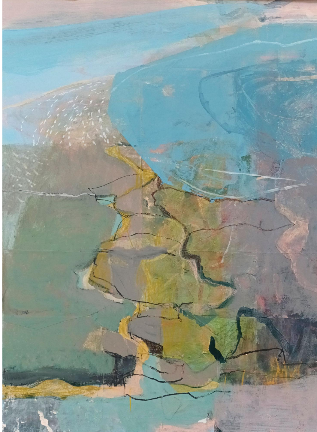
Flood Tide Sweeping SOLD acrylic on paper 65 x 48cm