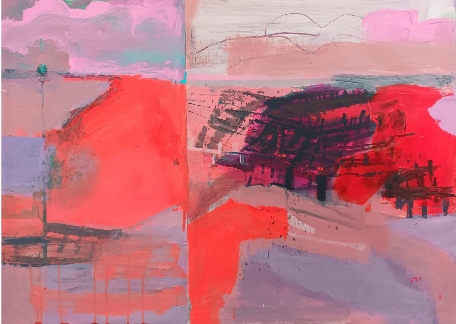
A Pink Day on the South Coast Acrylic on paper 71 x 96 cm