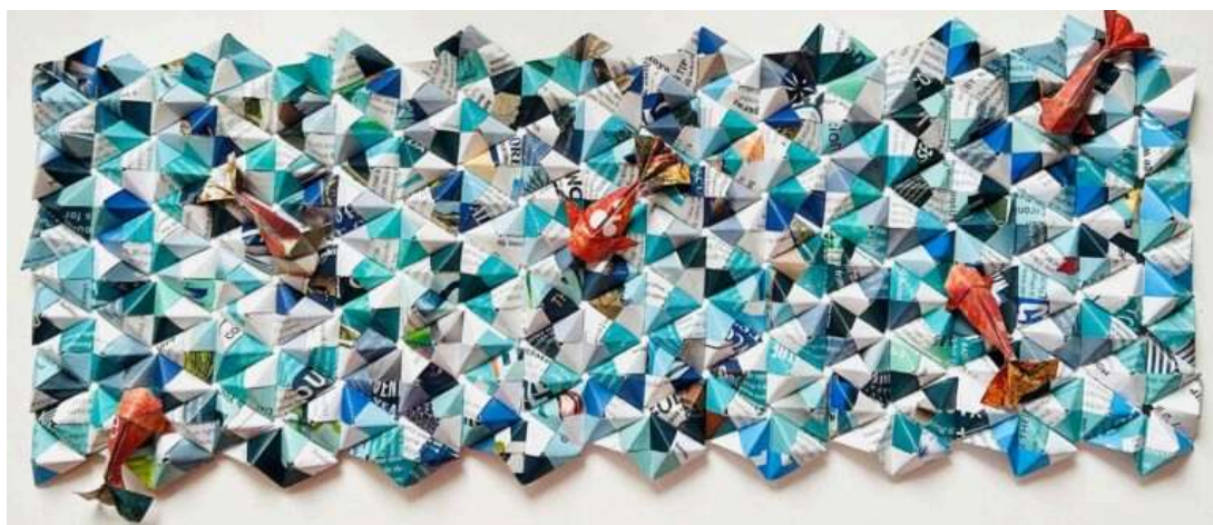
Amy-Hughes Ripple of renewals

Ayres House Studios in Wallingford , an old rectory building in which there are 14 artist studios ranged over three floors, where visitors will find a remarkable diversity of techniques, materials and creative voices. Look out for intricately-folded paper works by Amy Hughes created from repurposed Waitrose magazines