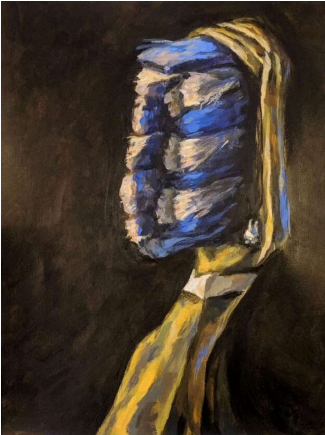
Girl with a Pearl Earring

In the nearby Methodist Church artist Jules Bishops works with natural materials at the intersection of art, science, and ecology, transforming the Oxfordshire landscape into living inks and pigments.