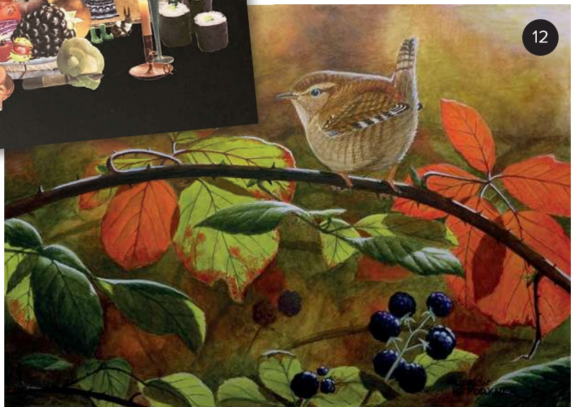
12 Andrew Forkner , Bramble Light – Wren in acrylic on panel, £295