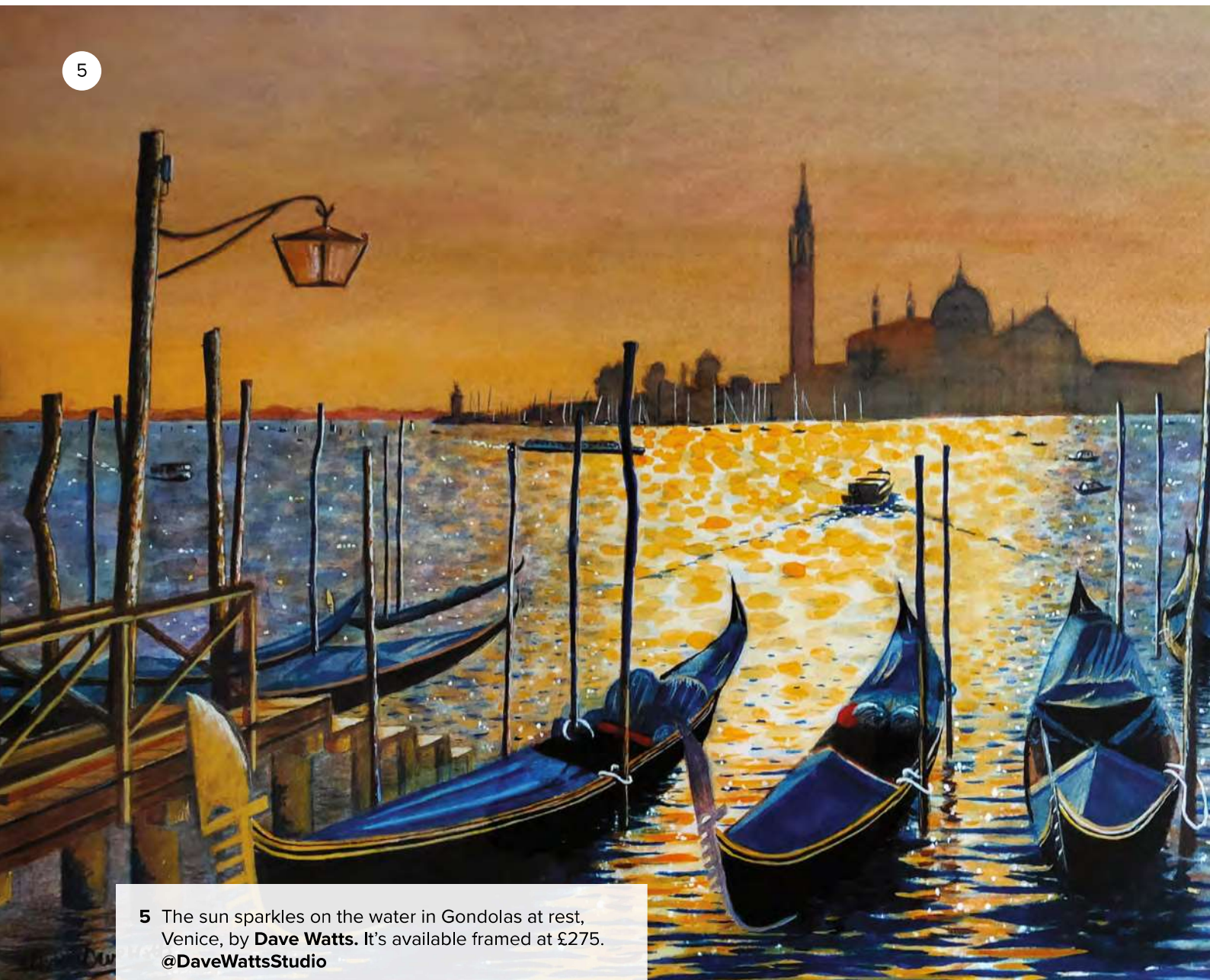
5 The sun sparkles on the water in Gondolas at rest, Venice , by Dave Watts . It's available framed at £275. @DaveWattsStudio