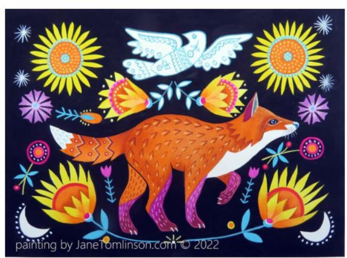
Light Always Wins Over Darkness

A new online Spring Show designed to whet the appetite ahead of the Oxfordshire Artweeks May festival opens on Friday, featuring 200 top Oxfordshire artists, designers and makers.