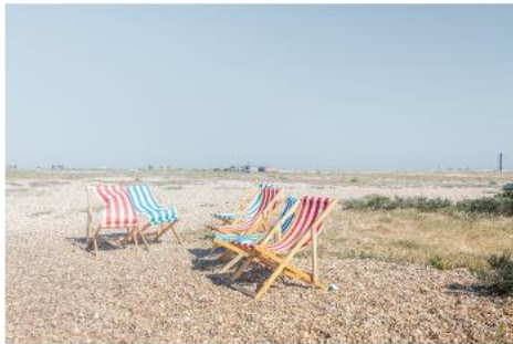
Olav Robinson Blowing in the wind

Showcasing the work of over 400 artists, artists, designers, and creators, the online Spring Show is a joyful and colourful celebration of spring and the world around us as a precursor to Oxfordshire Artweeks Festival (May 4-27), when you can view the artists' work for yourselves. CLICK HERE