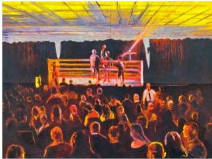
Geo Bobov in the red corner Oxford

To give you a taste of Oxfordshire Artweeks' famous county-wide arts festival next month, a new online Spring Show offers a tantalising glimpse of the talent, extent and variety of art we can soon see in person.