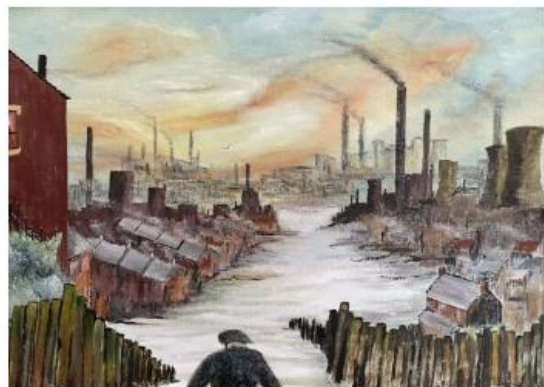
John Cantar Wantage

Our local landscape features large, from clouds scudding over The Ridgeway to a Red Kite sculpted in wood, bluebell woods, the Radcliffe Camera, the cooling towers of Didcot Power Station, Northern Lights taken in Oxford's Outleslow Park and industrial wastelands.