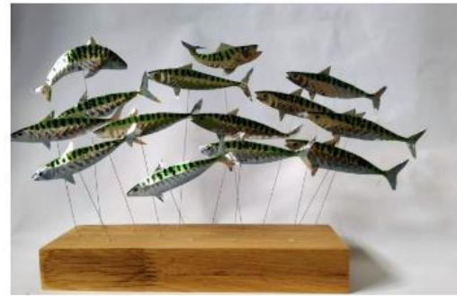
Viv Hughes Tin Fish Great Cassell

From painting and ceramics to jewellery, collage, sculpture, prints, carvings, photography, glasswork, furniture and so much more, the inspiration and expertise involved comes from all corners of the globe.