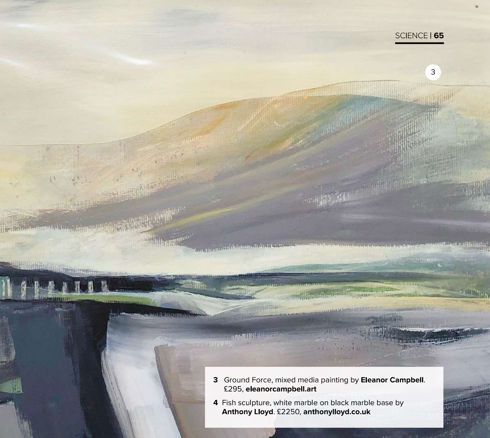
3 Ground Force, mixed media painting by Eleanor Campbell . £295, eleanorcampbell.art