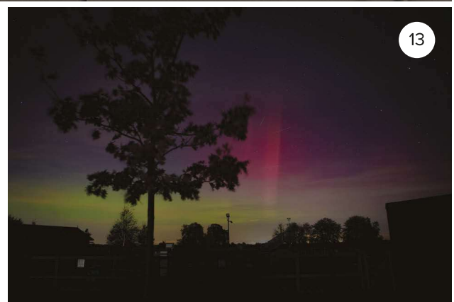
13 Aurora over Cutteslowe Park is a photograph taken of the Northern Lights as seen one evening in Oxford last November. By Karen Morecroft of Oxford Photographers (Artweeks venue 221), it can be recreated at any size.