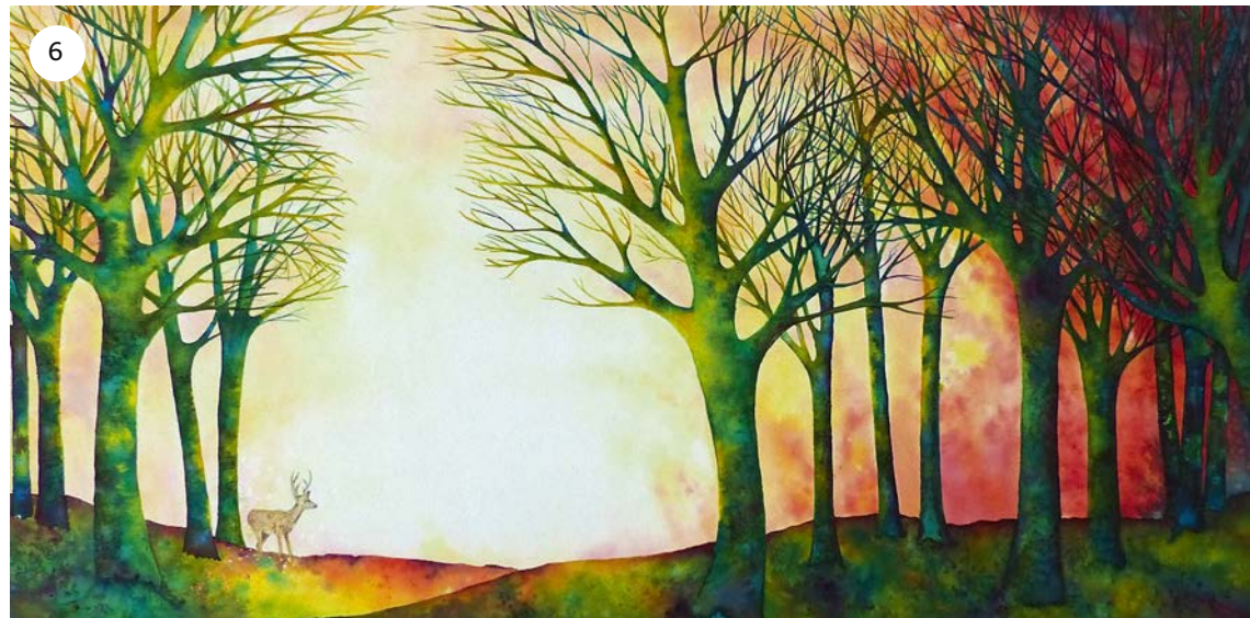
6. Forest Dawn by Sue Side captures the interaction between trees and their landscape. Ink and gold foil sueside.com