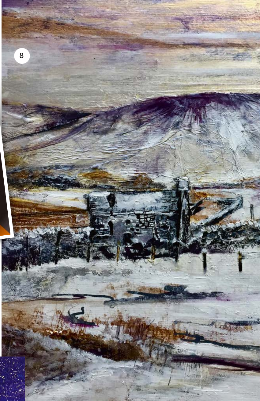
8. Mixed media artist Jessica Parker celebrates light on a snowy landscape with Golden Winter , £275. kingfisherstudios.biz