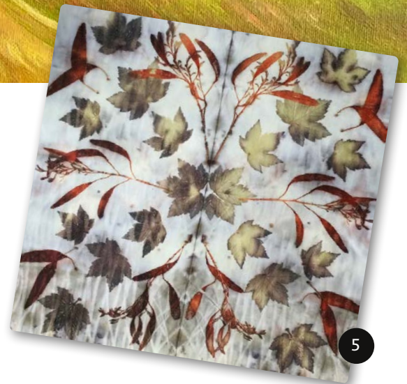
5. Inspired by nature, Caroline Nixon's art evolves with the seasons. Ecoprint cushion £80 handmadetextilesbycaroline.co.uk