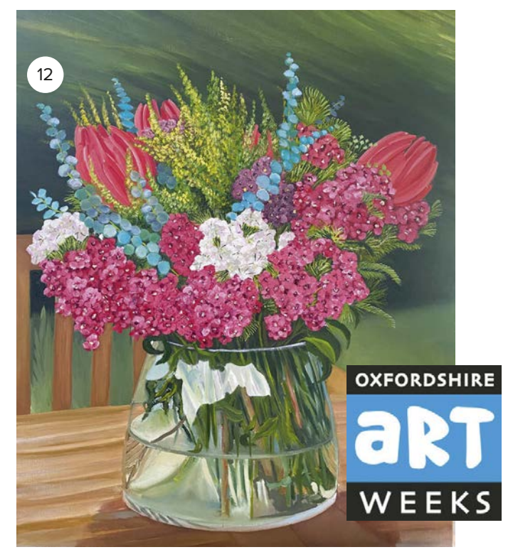
12 Garden flowers is an oil painting by Jayne Ford. £495, jayneford.com