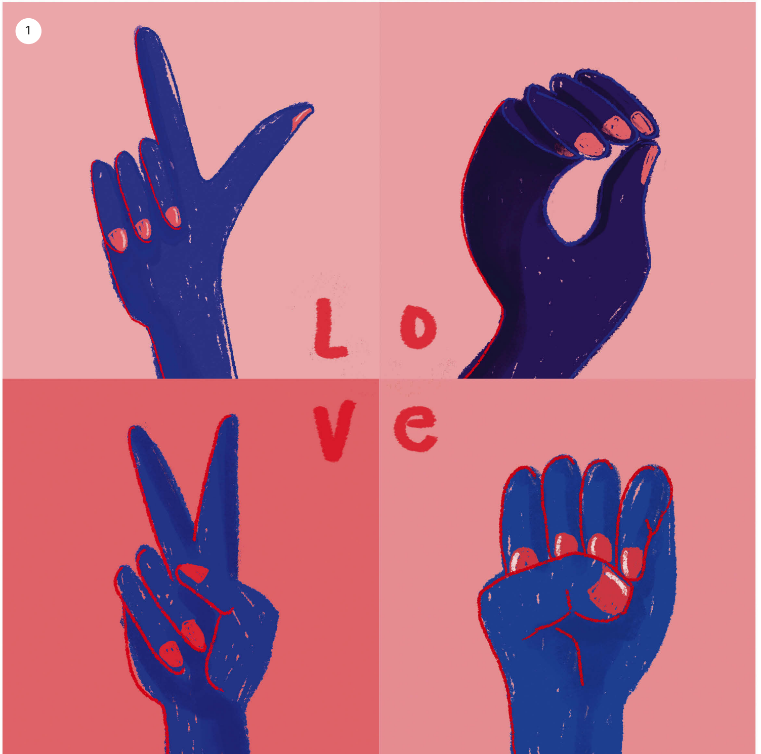
1. Clare Davis Love! (20cm x 20 cm) is available for £20 from claredavislondon.co.uk ►

GREAT ART AND DESIGN TO FALL IN LOVE WITH