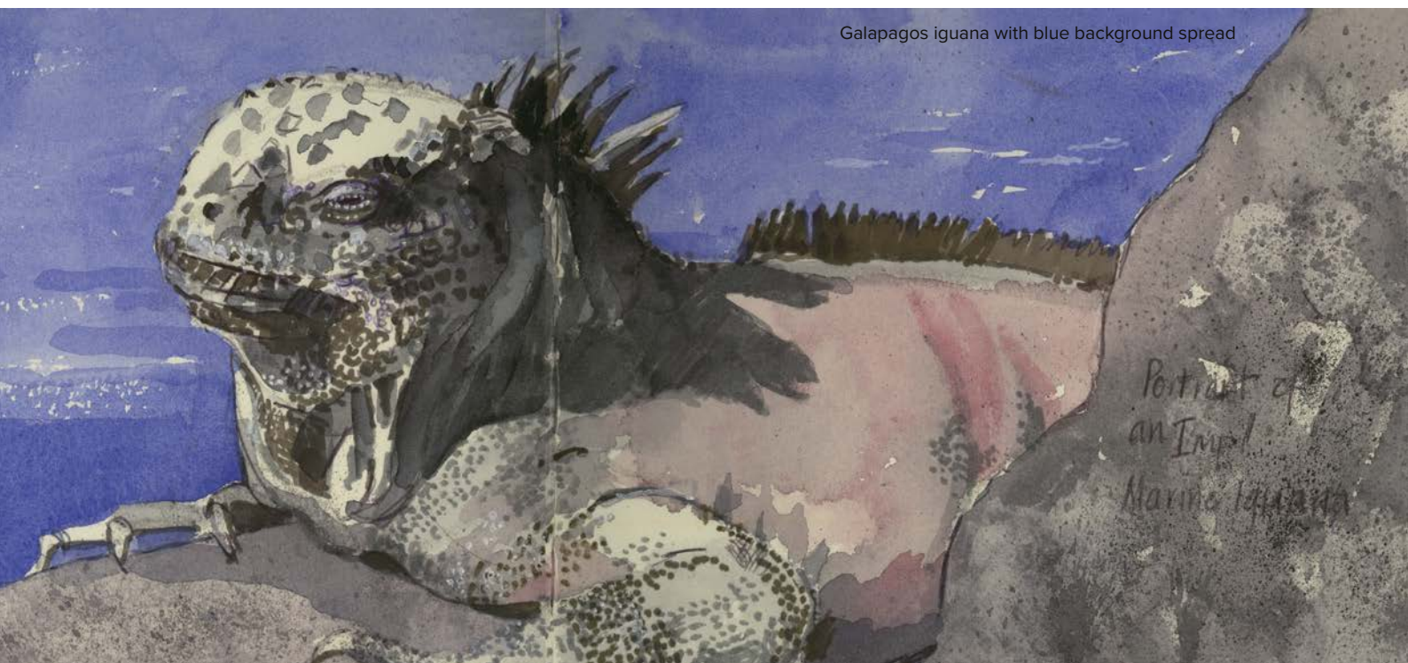
Galapagos iguana with blue background spread

Galápagos Sketchbook by David Pollock (Pallas Athene), September 2023 £19.99