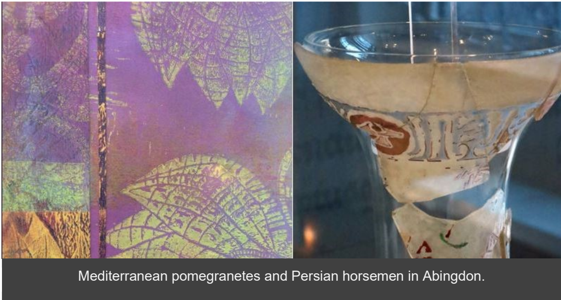
Mediterranean pomegranates and Persian horsemen in Abingdon.

Another exhibition that is now rescheduled (for next Spring) has been inspired by treasures from the past. The HapticArt group of textile artists have each produced sumptuous pieces inspired by items from the Abingdon Museum collection, from a Victorian glove to an ancient vessel that wended its way to Oxfordshire from Persia with returning crusaders and depicts thirteenth century polo-players. Delve further into the town's past with our Five-minute read .