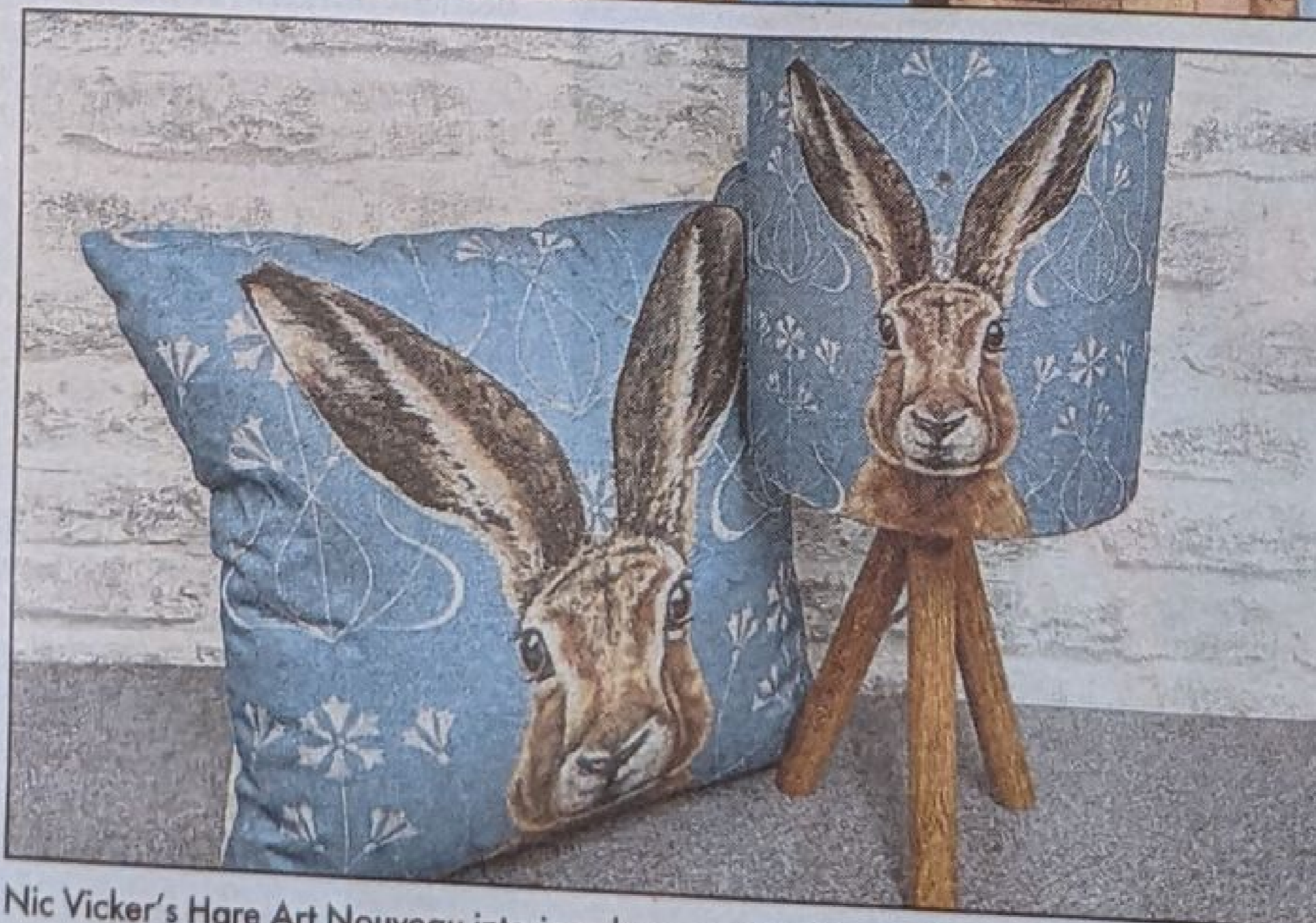
Nic Vicker's Hare Art Nouveau interiors, here, and Roll Up Roll Up, above