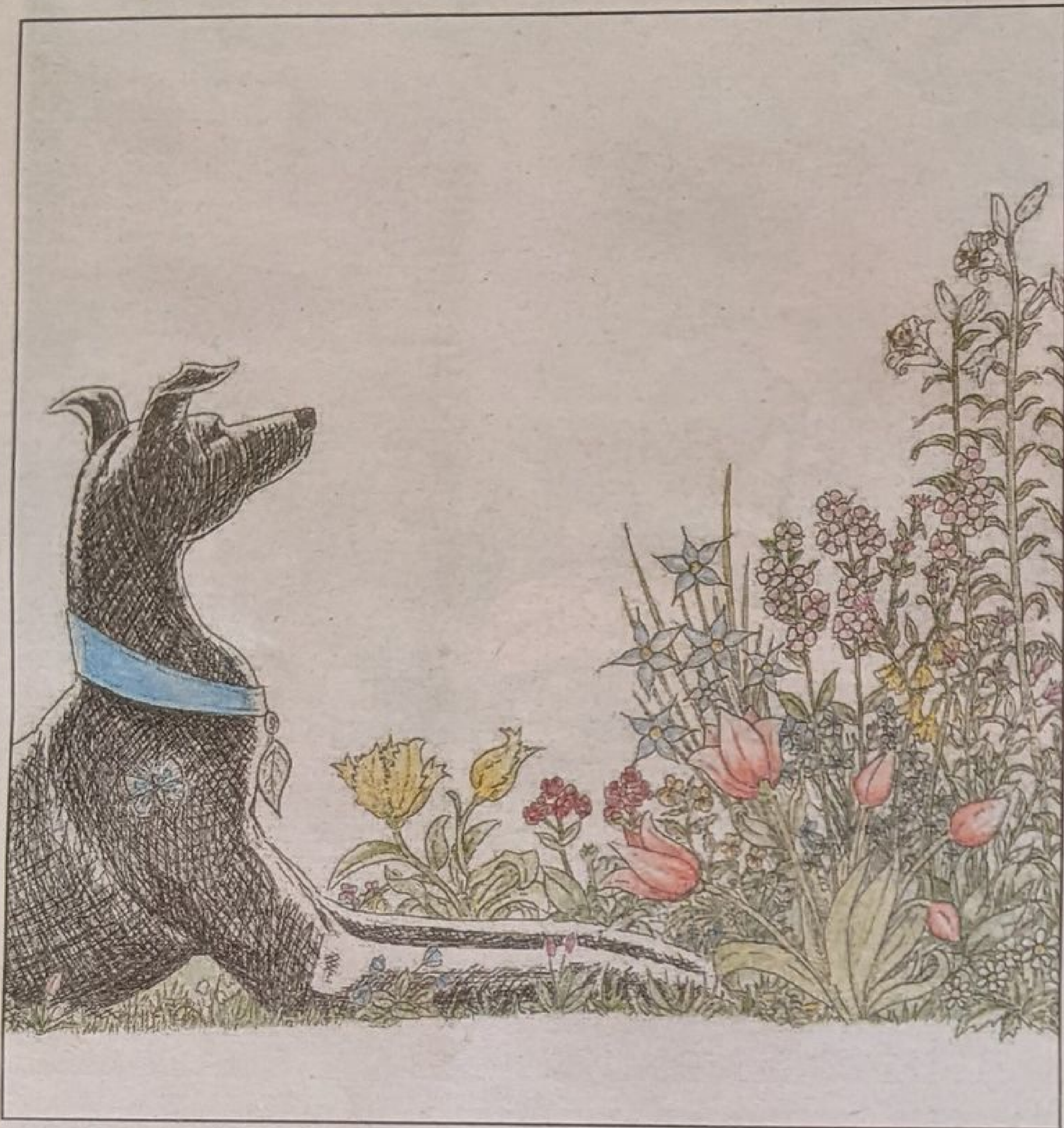
Extract from Nic Vickery's Spring Garden