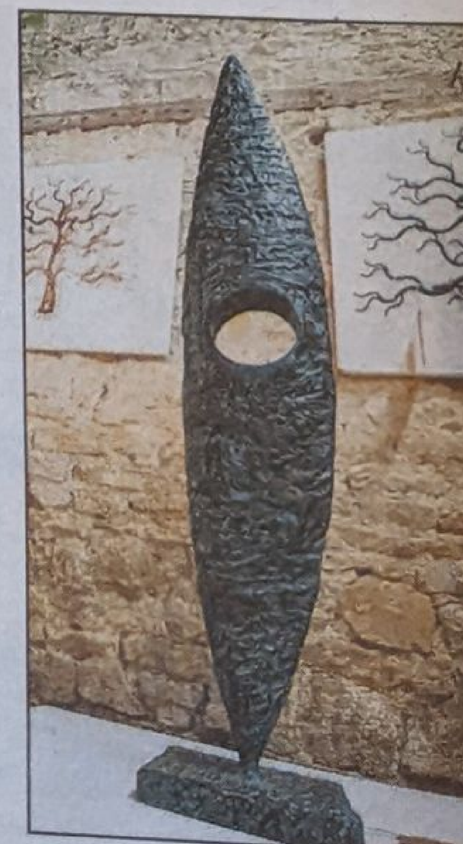
Asthall Old Forge.