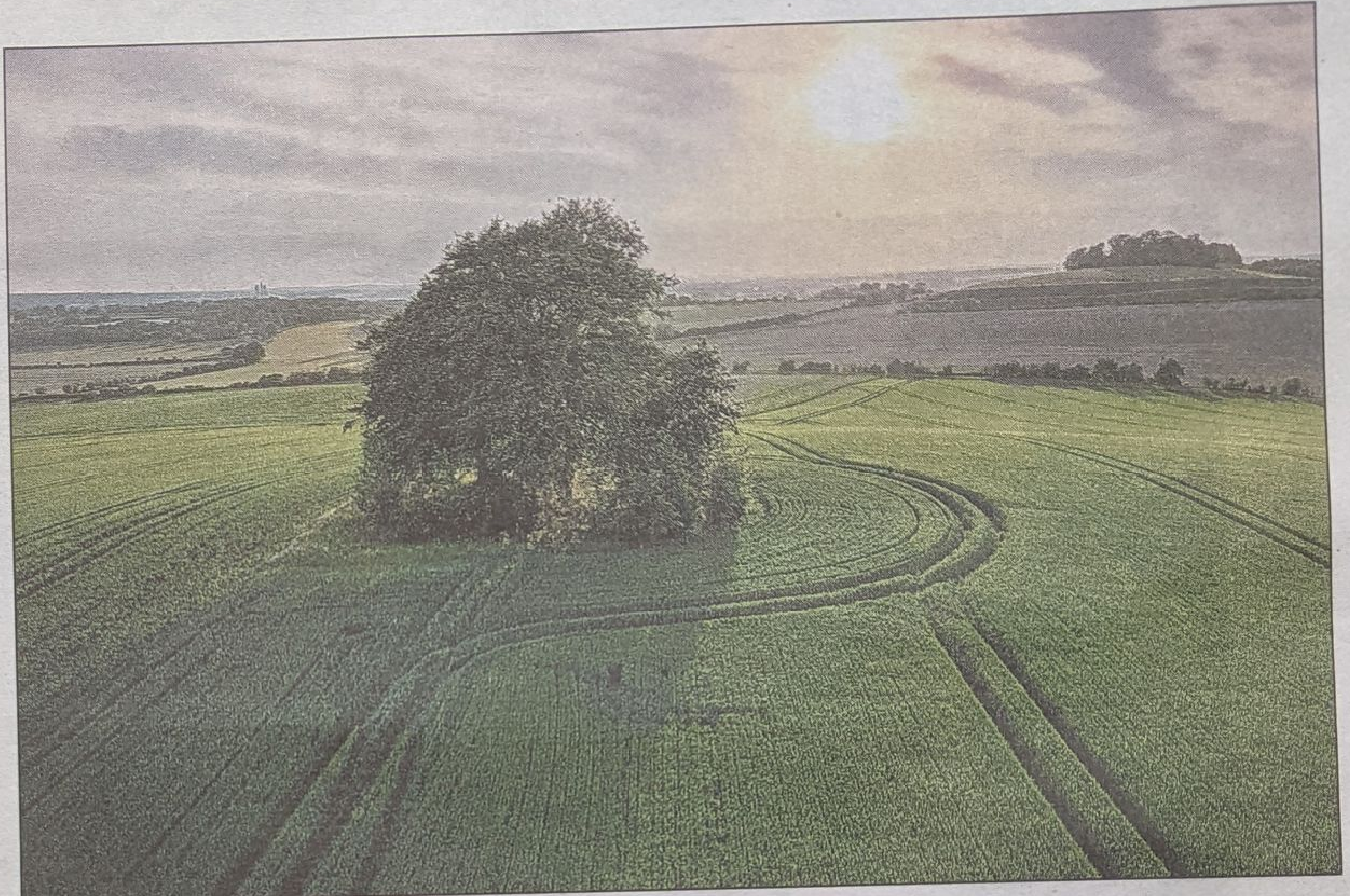
A stunning view of the Berkshire Downs by drone

•More on Oxfordshire Artweeks at artweeks.org