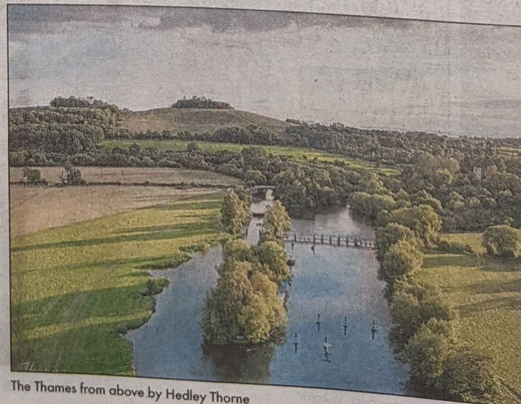
The Thames from above