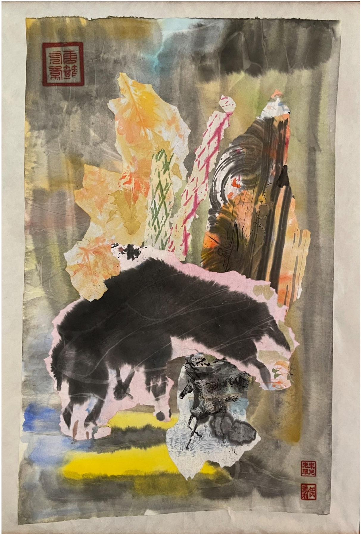
Figure 4 Tony Howells 2