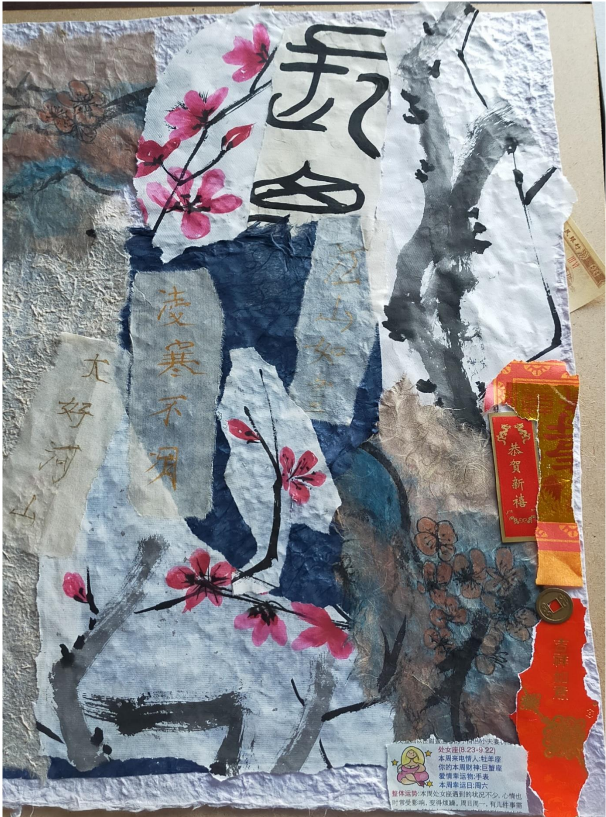
Figure 5 Chris Newson