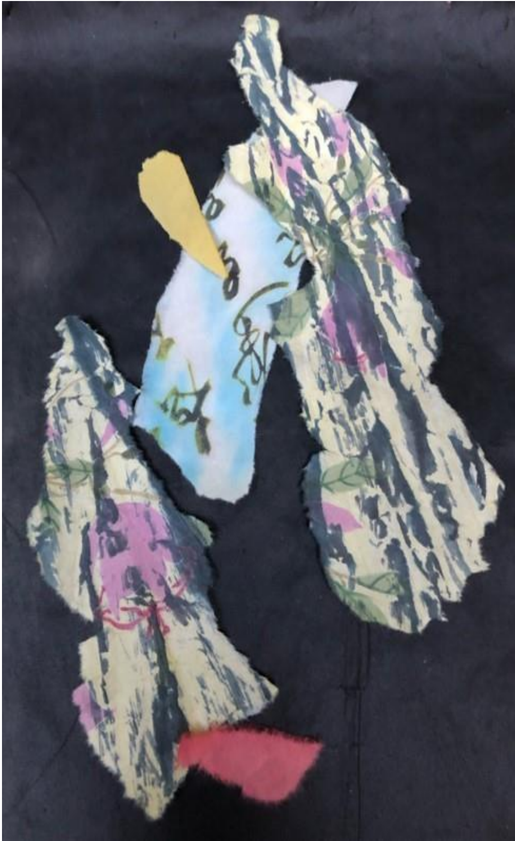
Figure 13 Pauline Cherrett