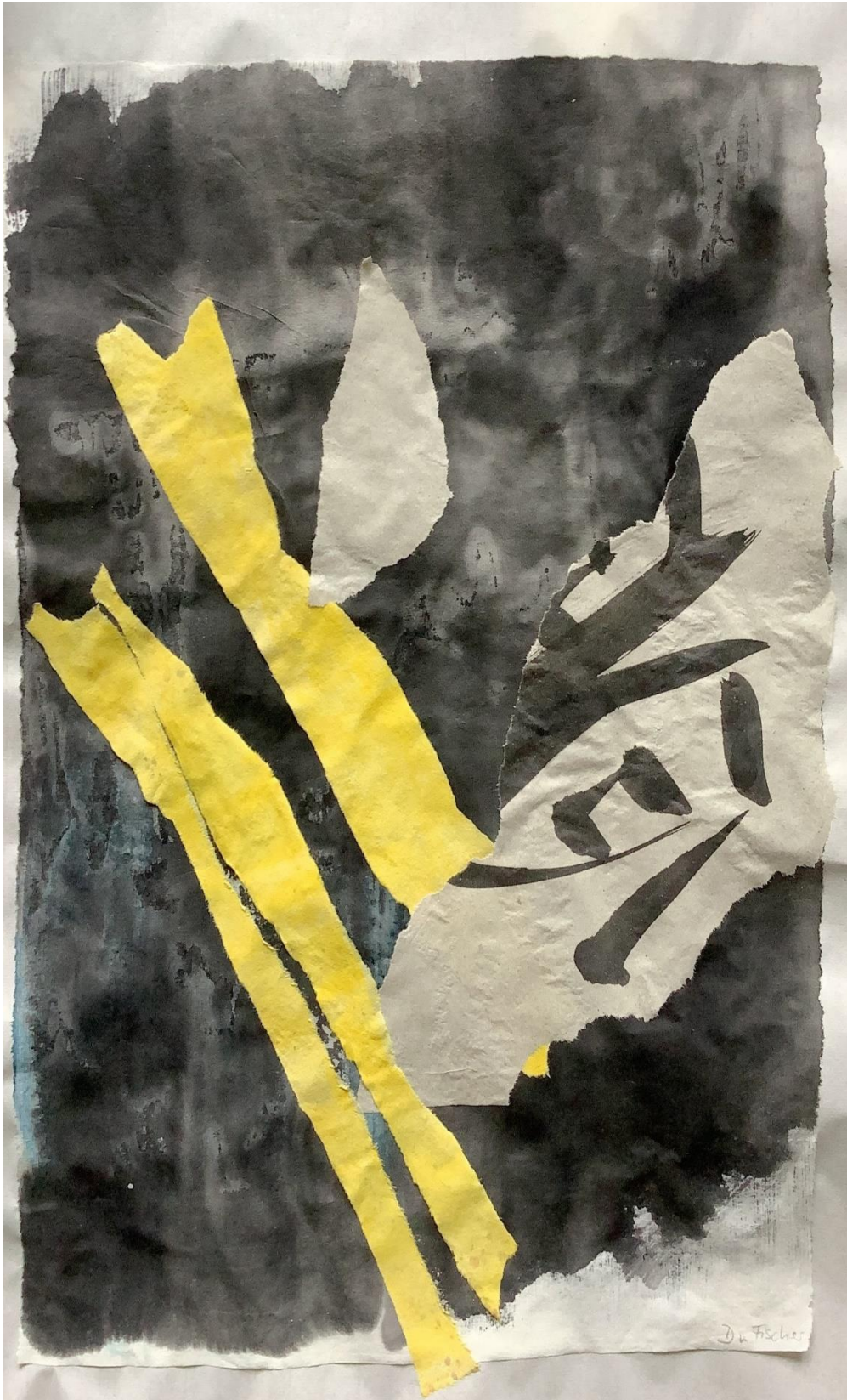
Figure 1 Dorothy Fischer