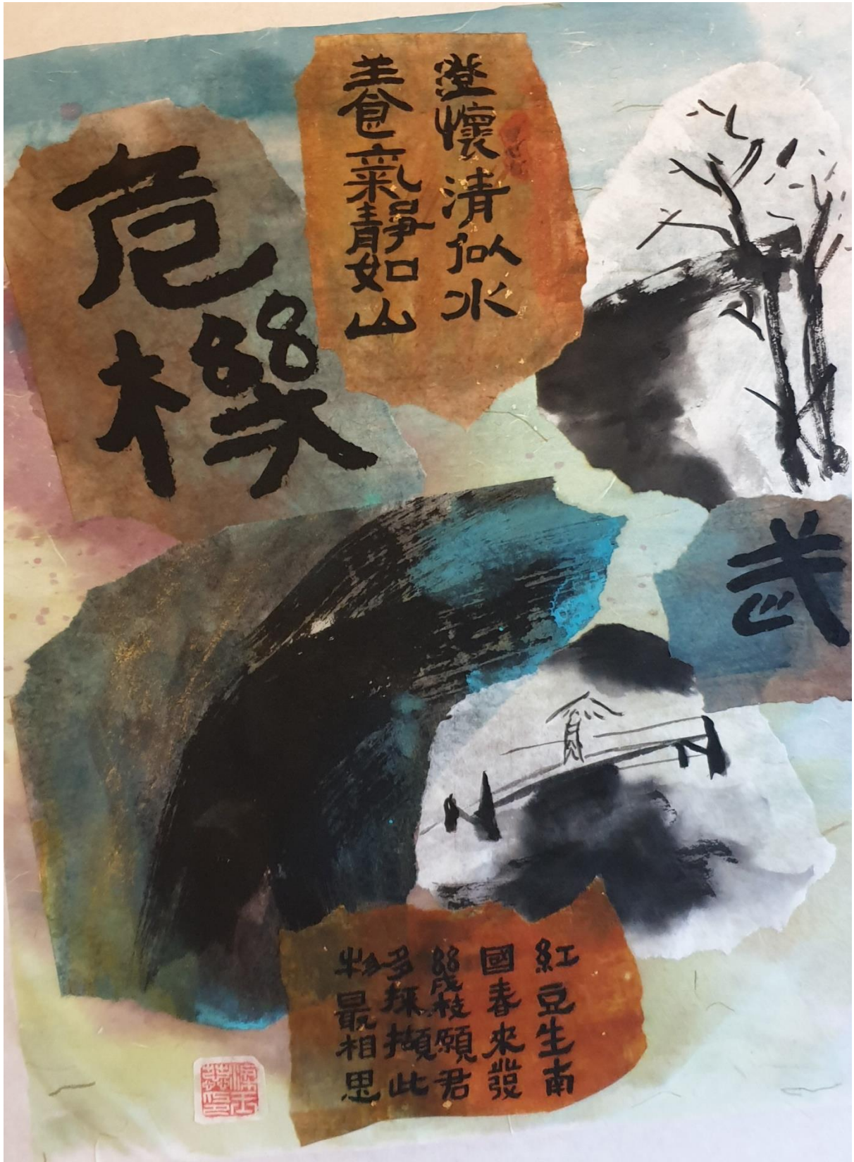
Figure 2 Looi Leung "Crisis"