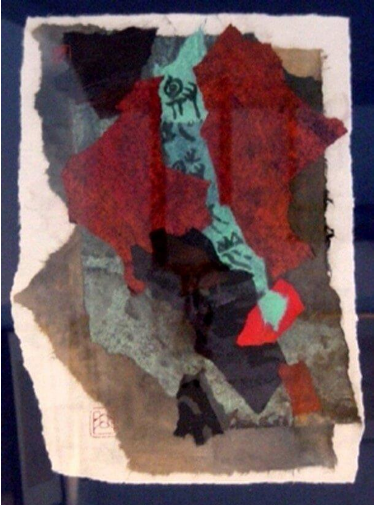
Figure 20 Leda Fletcher