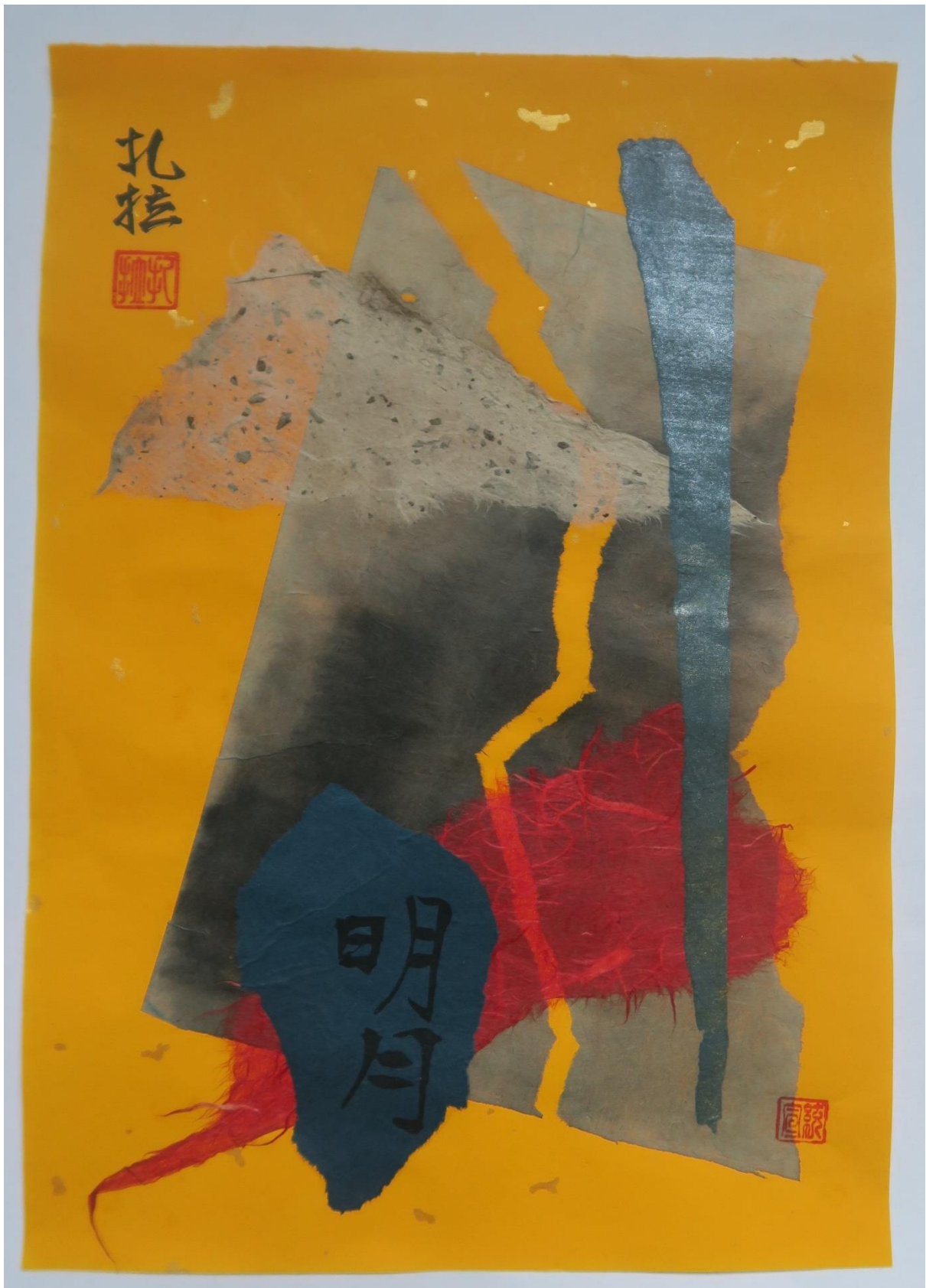
Figure 17 Zara Taylor 4 Gold paper