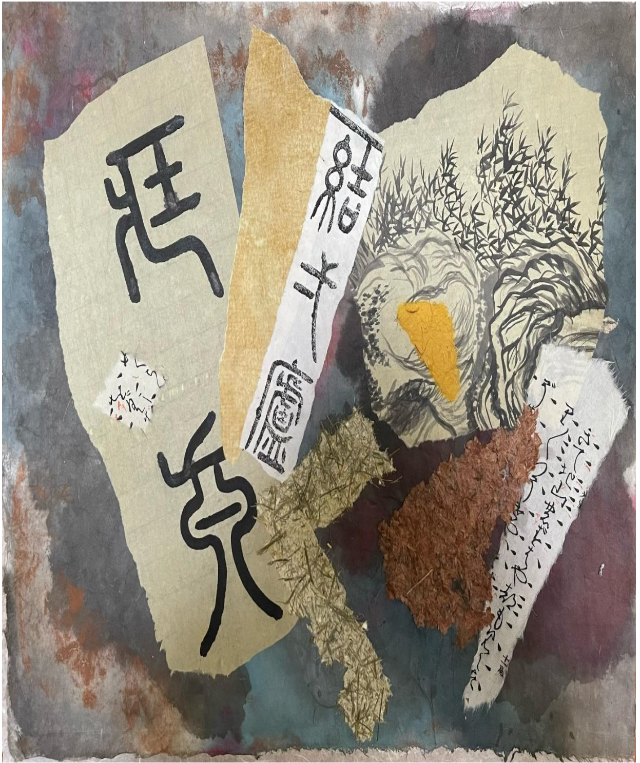
Figure 11 Colleen Kangwai