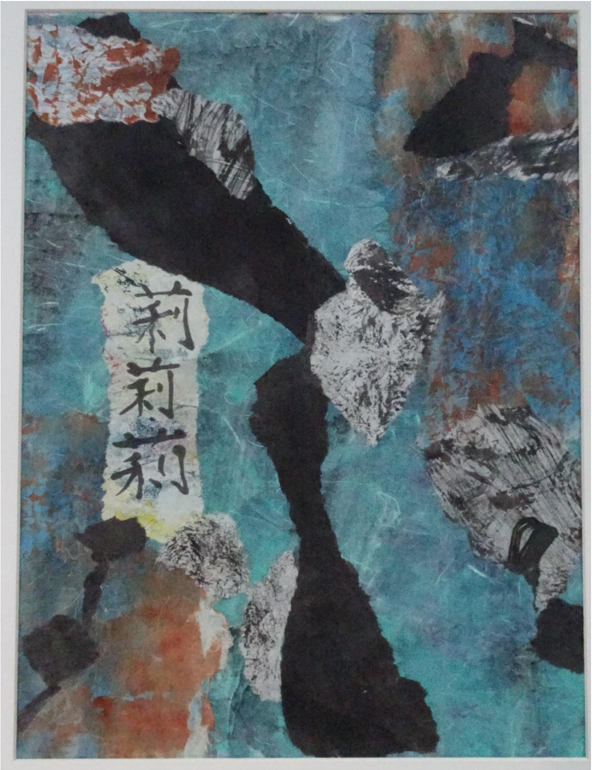
Figure 8 Gillian Graffey 1