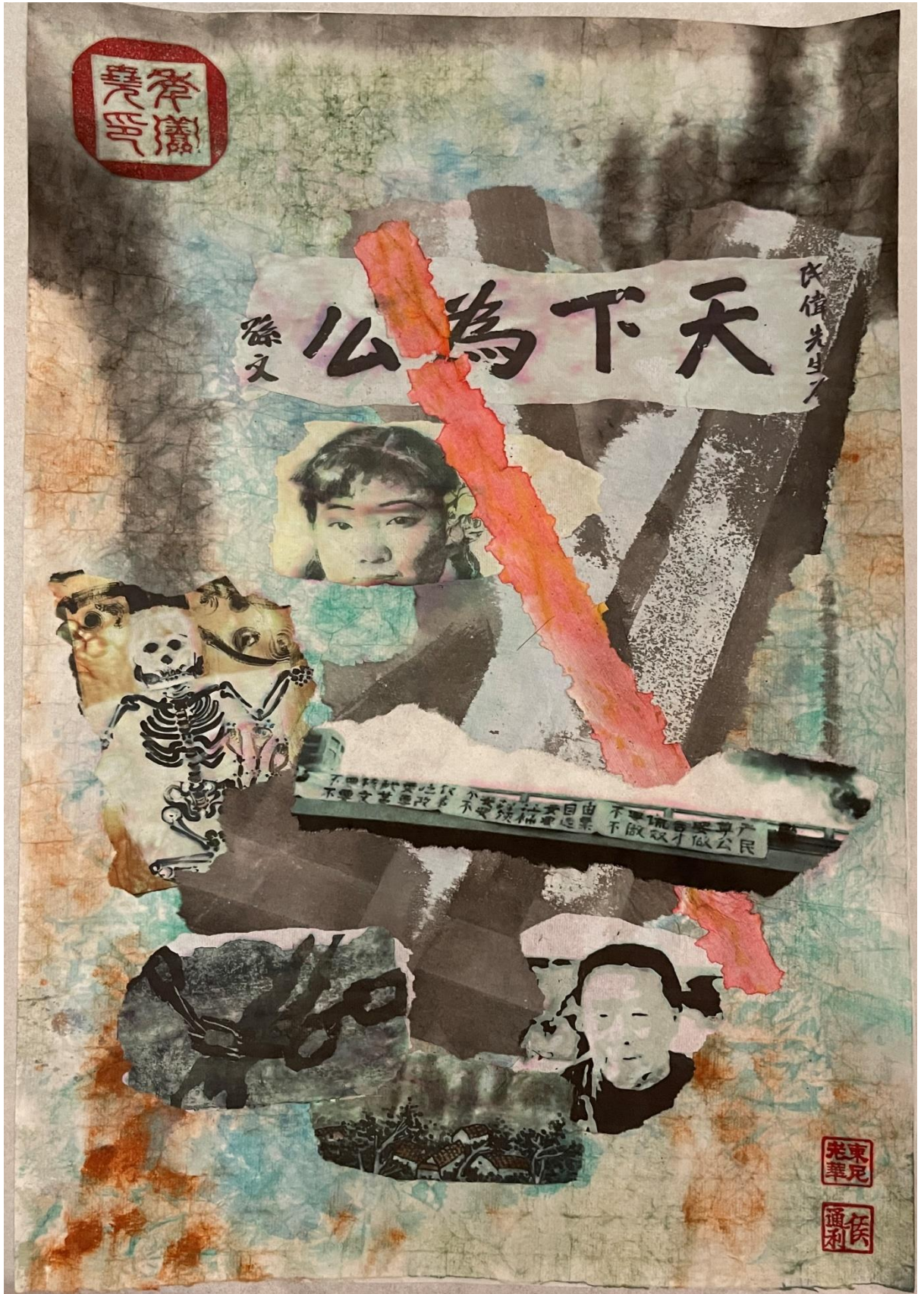
Figure 3 Tony Howells 1