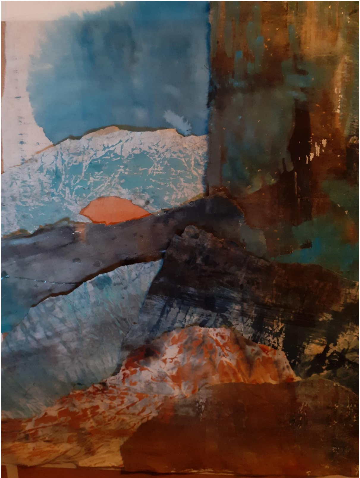
Figure 22 Kim Duffell 2