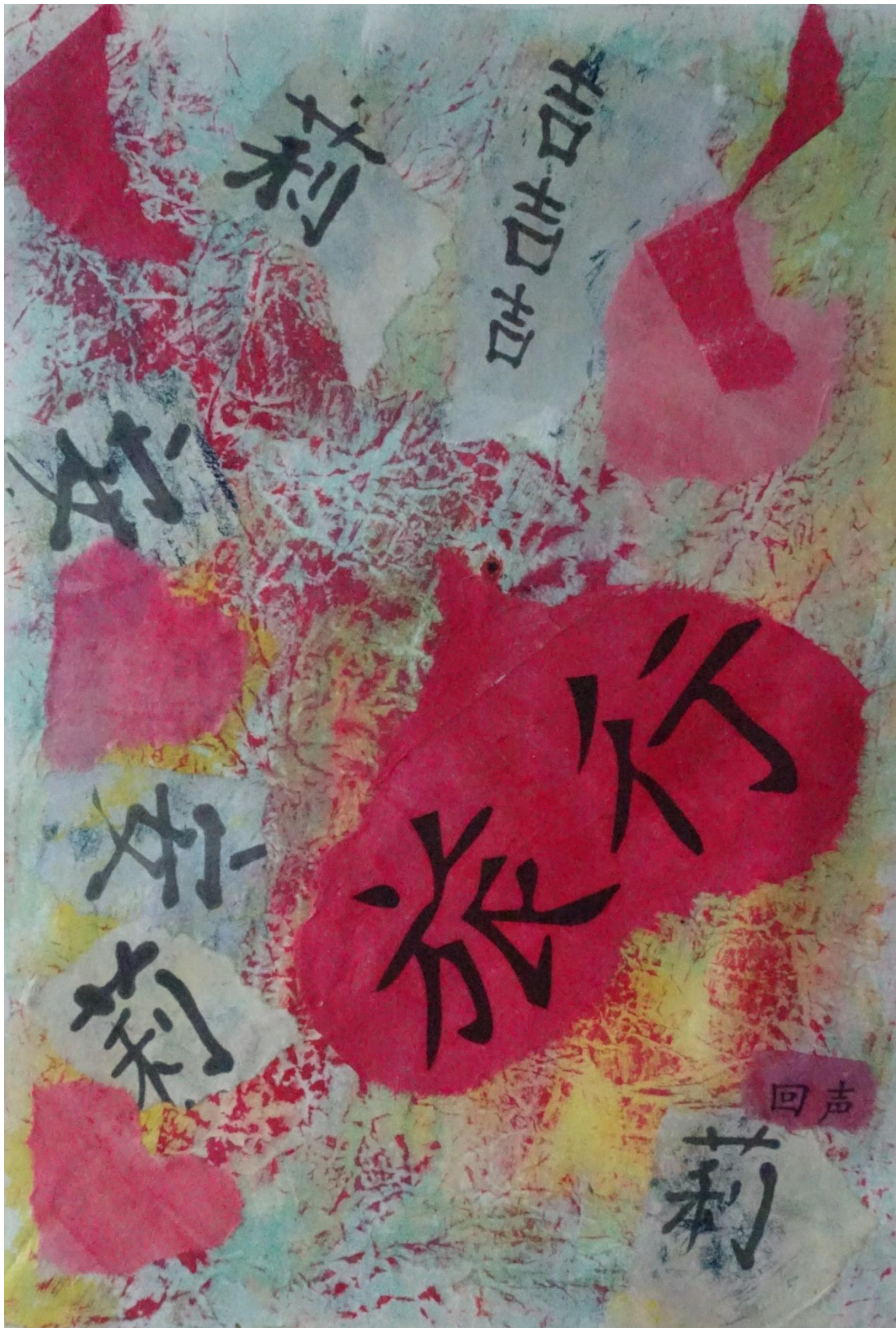
Figure 9 Gillian Graffy 2