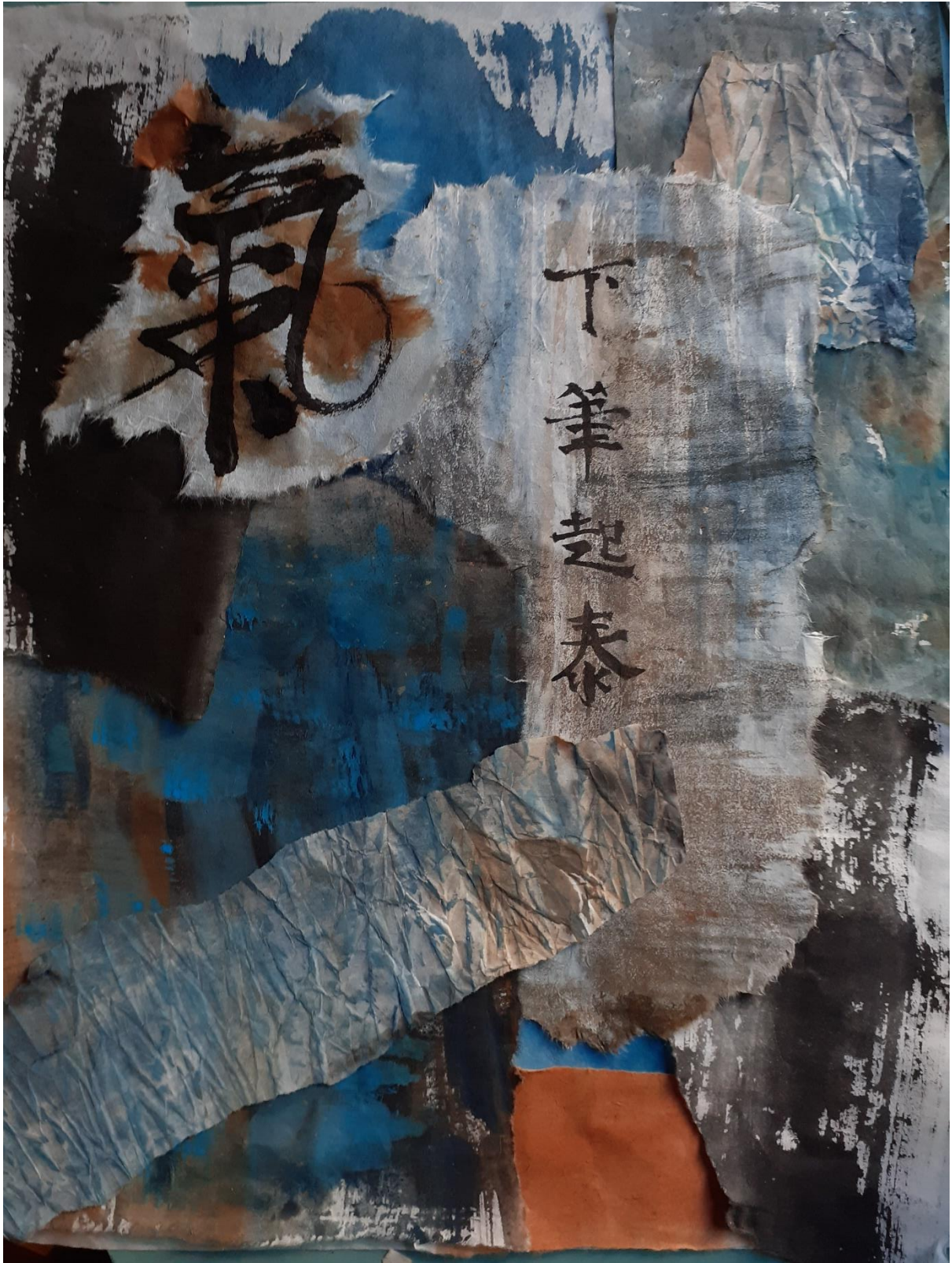
Figure 21 Kim Duffell 1