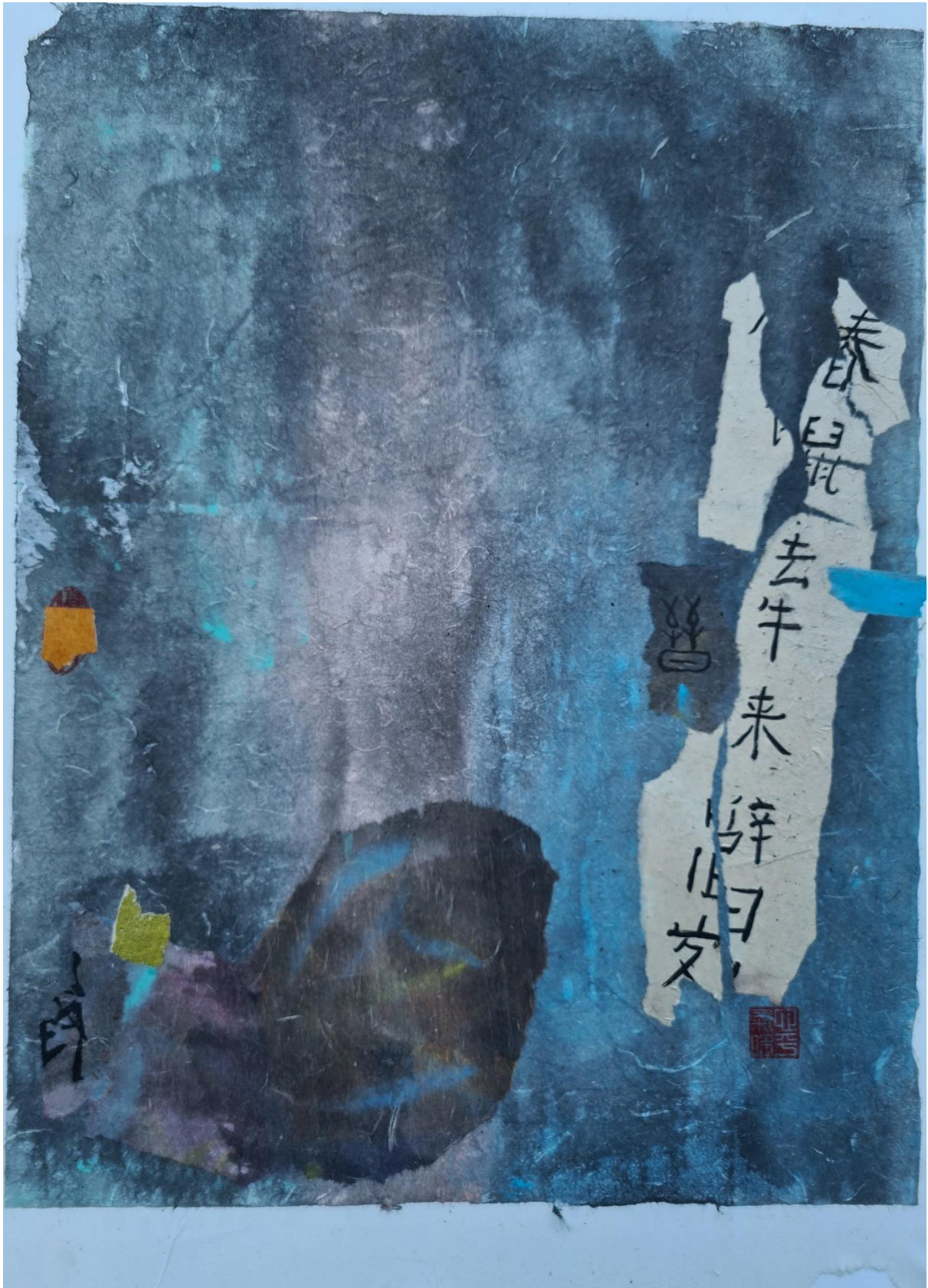
Figure 19 Keith Hickson Apparition