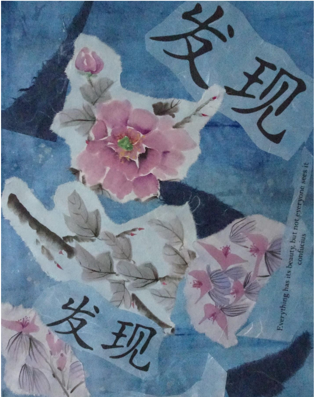
Figure 10 Gillian Graffy 3