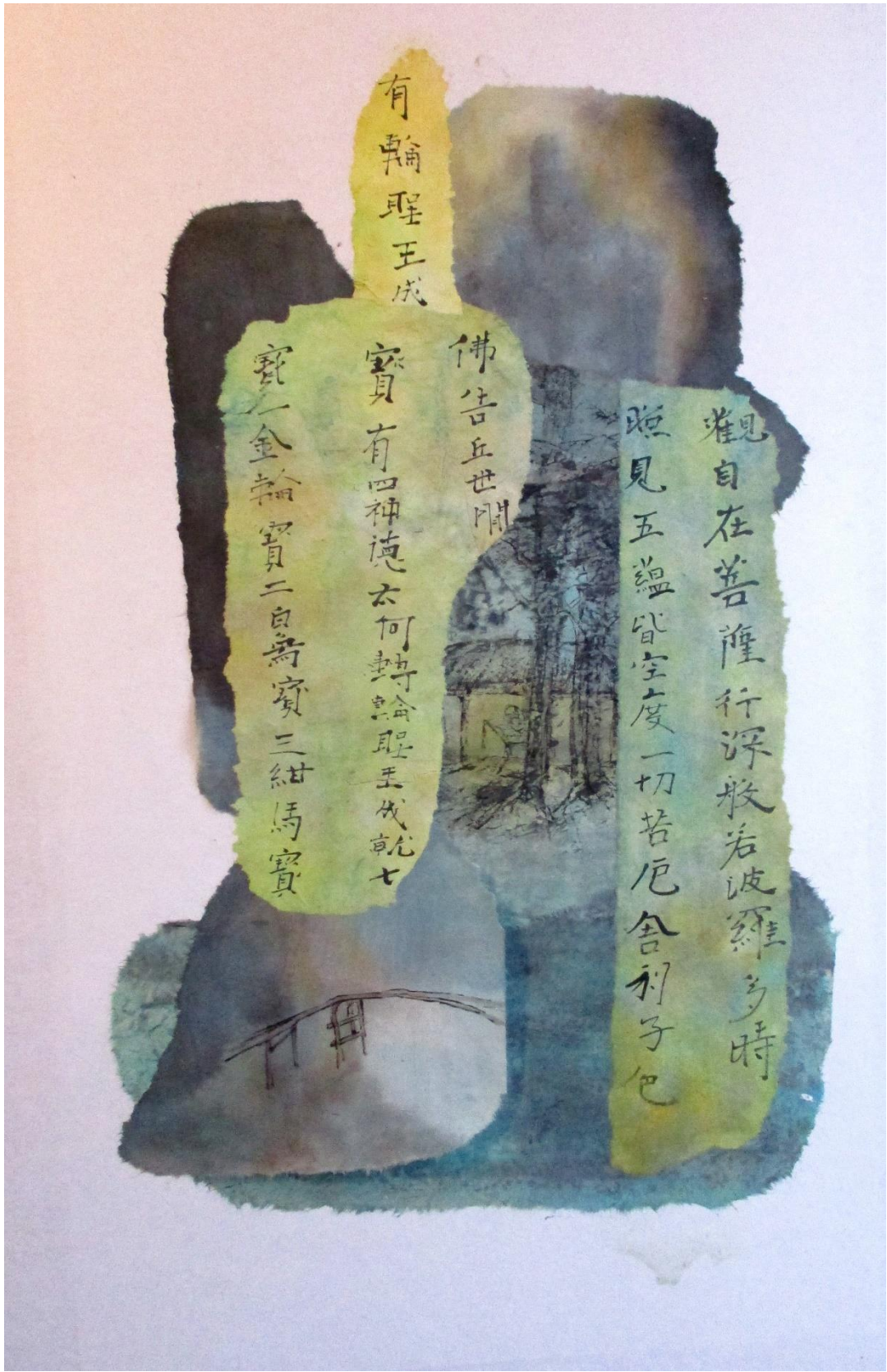
Figure 23 Ann Massing