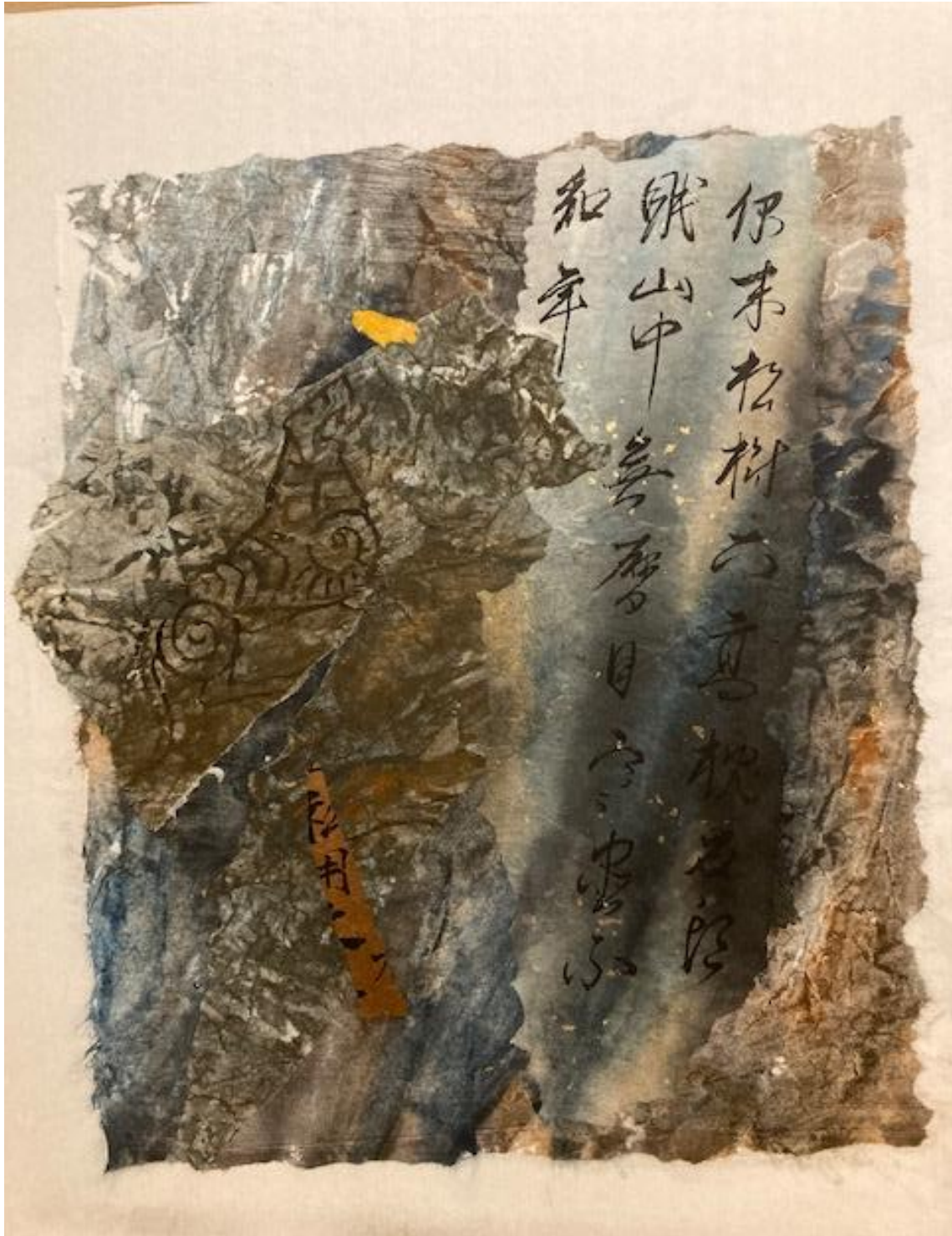
Figure 7 Margaret Wall