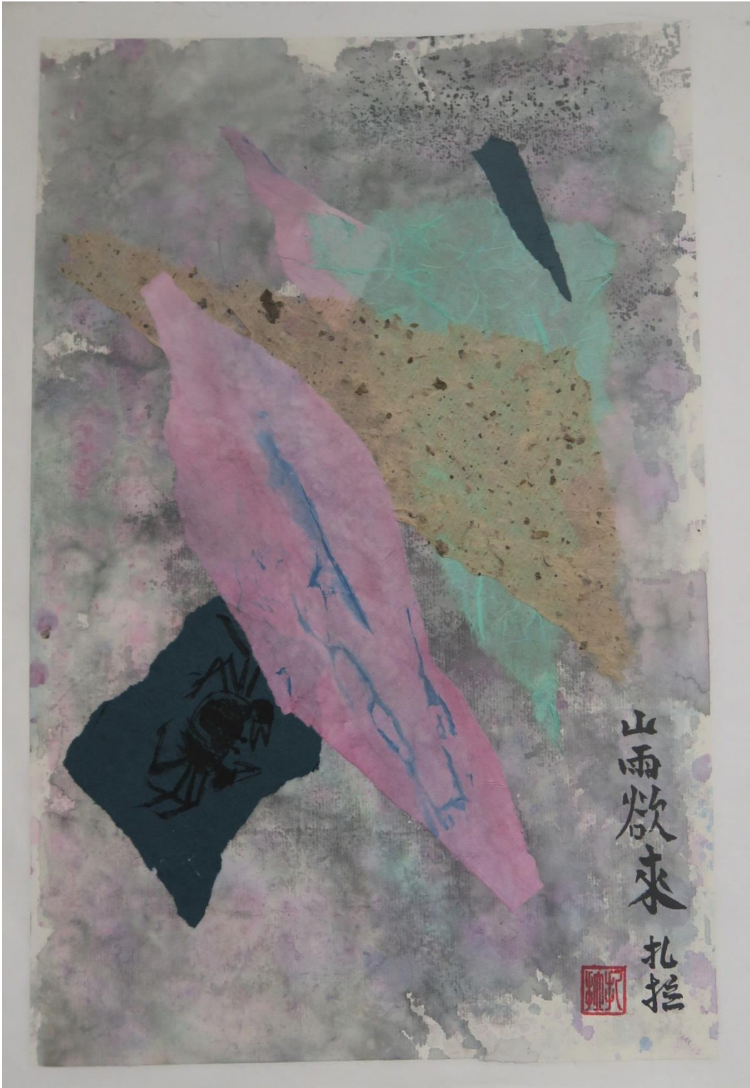
Figure 14 Zara Taylor 1 After the storm