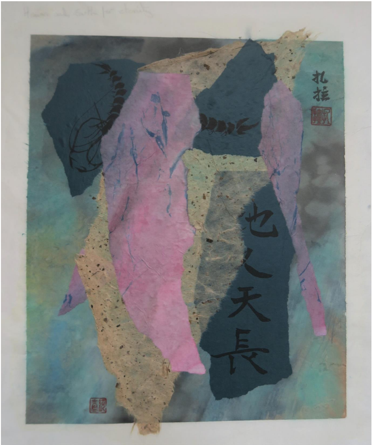
Figure 15 Zara Taylor 2 Heaven and Earth