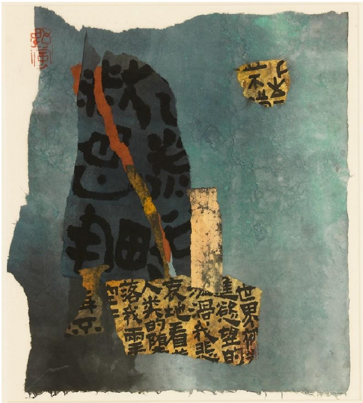
Figure 24 Collage by Leilei on display in Gallery 11 of the Ashmolean Museum until May 23rd 2023