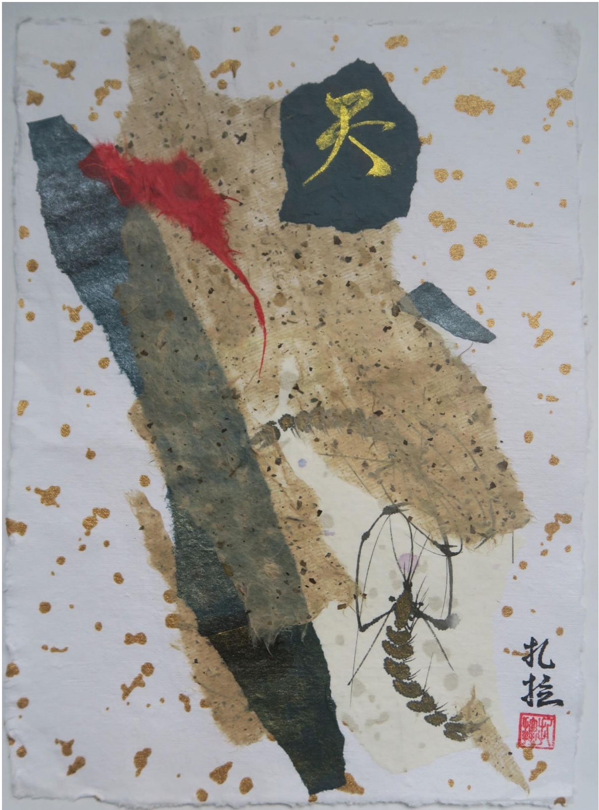
Figure 18 Zara Taylor 5 Indian Gold Fleck