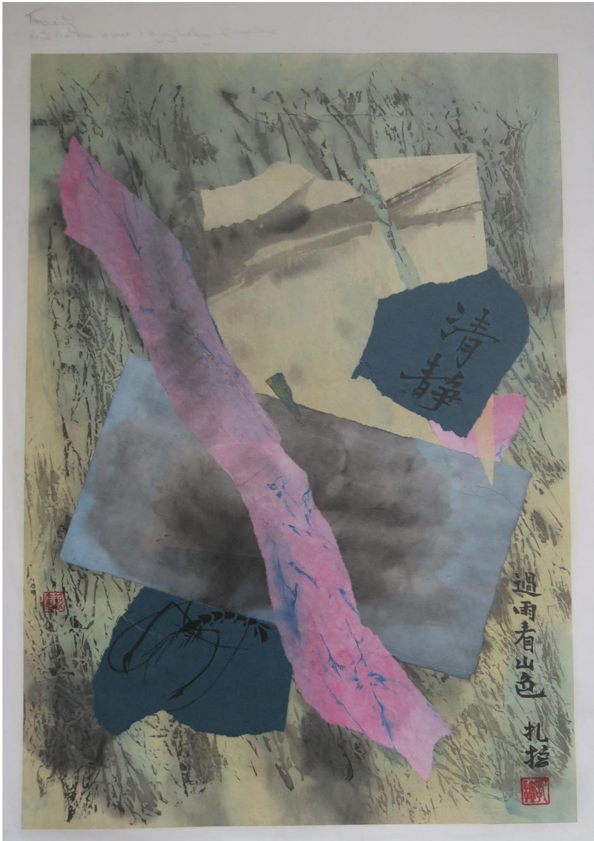
Figure 16 Zara Taylor 3 Before the storm